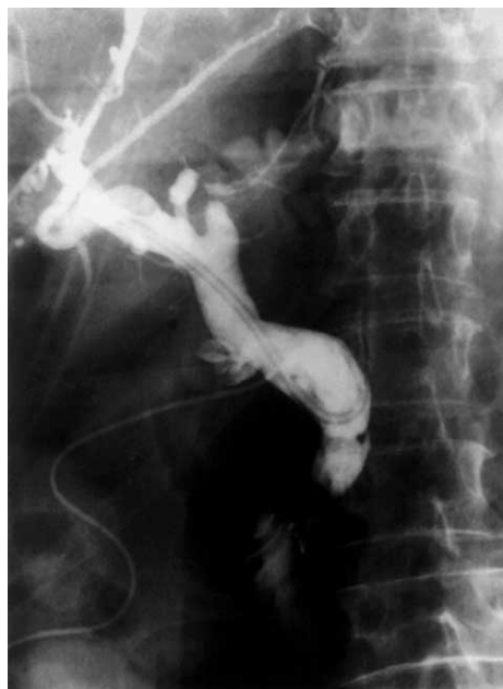
Fig. 3. Intraoperative biligraphy after pericystectomy, choledochotomy et T-tube drainage.

was performed, followed by an exploration of the common bile duct. Remnants of daughter cysts were found approximately 3 cm from Vater's papilla and cleared from the duct. By application of methylene-blue dye the communication between hydatid cyst and left hepatic duct was verified. Pericystectomy was performed and left hepatic duct was closed with sutures. Intraoperative biligraphy was performed, showing no residual abnormalities of the biliary tree (Figure 3).