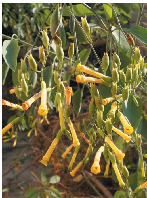
Fig. 1. Nicotiana glauca Graham, Komiža, May 2002

Nicotiana glauca , tree tobacco (Fig. 1), is an evergreen perennial, glabrous soft-wooded shrub or small tree, up to 6 m tall, with stems that are laxly branched. The leaves are stalked, alternate, elliptical to lanceolate or oval, pointed, bluish or greyish-green. The flowers are greenish-yellow, 30–40 mm long, many are borne in a lax panicle. The corolla is tubular with a short-lobed limb. The fruit is an egg-shaped, two-valved capsule, 7–10 mm long and slightly longer than the persistent papery calyx. It produces a large quantity of tiny seeds, which can be dispersed by wind and water. All plant parts are extremely poisonous (GOODSPEED 1954, MOORE 1972, BLAMEY and GREY-WILSON 1998).