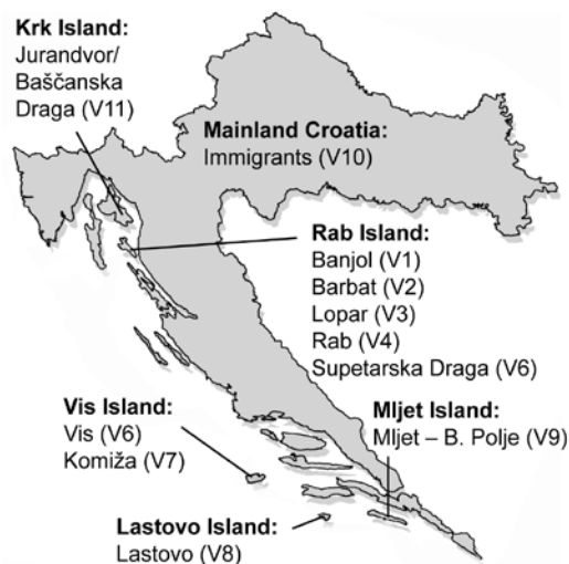
Figure 1. Geographic location of the investigated islands of Rab, Vis, Lastovo, and Mljet. Villages from 1 to 9 (V1-V9) are study populations. Immigrants into the islands originate from mainland Croatia (V10).

Assuming a polygenic nature of QTs and exponential distribution of effect size (30,31), the limited number of founders would initially introduce an unknown number of rare mutations (variants specific for their individual genomes) into the gene pool of the isolate they had established. Through such a “founder effect,” the frequency of those variants would thus increase from extremely rare in the general population (eg, f < 10^{-8} ) to common in that particular isolate ( f > 10^{-2} ). We present a hypothetical case of a geographic cluster of four such isolated populations that share similar environment and lifestyle (eg,