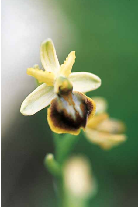
Fig. 3. Ophrys tommasinii Vis., Kvarnar, island of Biševo, April 2001.