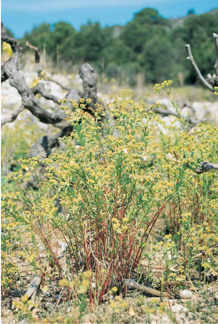
Fig. 2. Euphorbia terracina L., abandoned vineyard in Sarbunara, island of Biševo, April 2001.

Along with the typical form of species Vicia lutea L. on the island we found individuals with hairy stem and leaves. According to HAYEK (1927:797) this taxa is recognized as V. lutea L. var. hirta Lois. In the Croatian Flora Checklist different varieties and forms are not listed as separate taxa, but we would like to point out the presence of this variety in the Croatian flora.