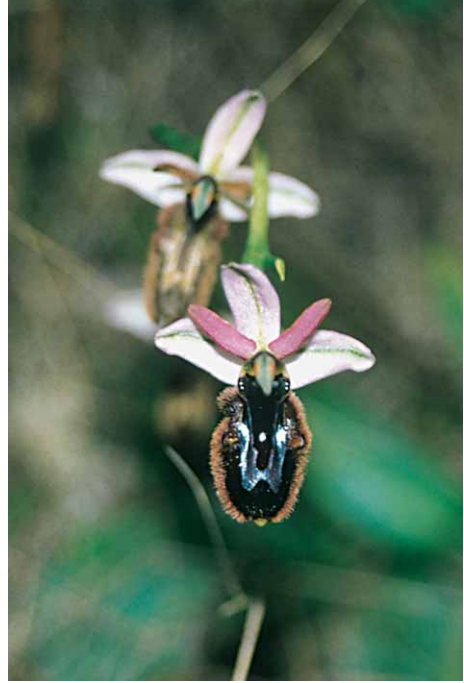
Fig. 4. Ophrys x lyrata H. Fleischm., Donja Sarbunara, island of Biševo, April 2000.

Ampelodesmos mauritanica (Poir.) T. Durand et Schinz is a westmediterranean species which findings on Balkan peninsula include only the island of Zakynthos in Greece, the island of Lastovo (TRINAJSTIĆ 1969) and islet Sv. Jerolim in the southern part of Istria, where its locality was devastated (FREYN 1877:464). This new locality on the island of Biševo represents an important contribution for the chorology of the species. In the recent fire in August of 2003, its habitat on the island was preserved. As the species is known to colonize the areas affected by fire, we suppose that its population on the island will increase in the near future.