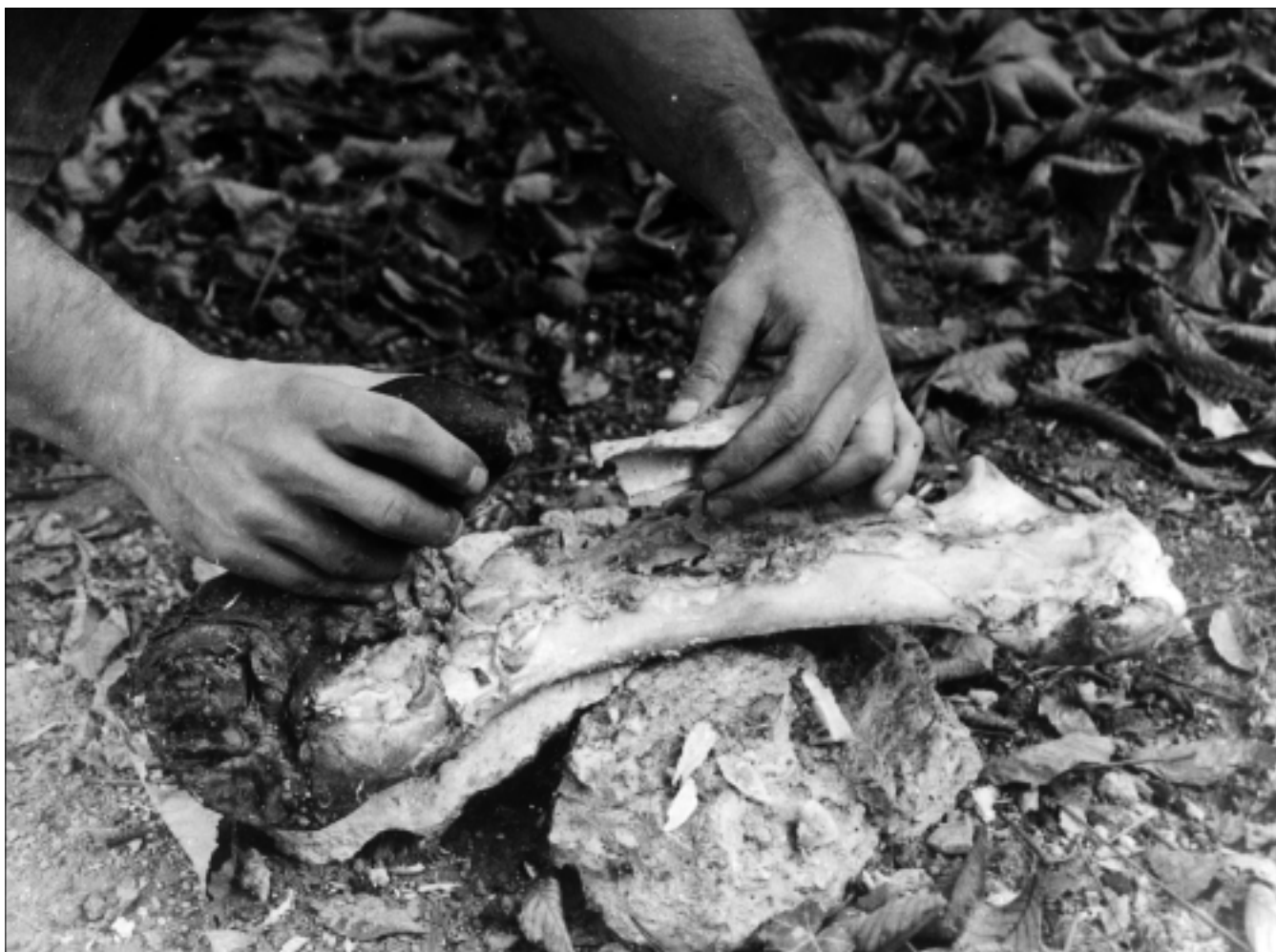
Fig. 1 Breaking of bone with a chopping tool

Afterwards, we performed the soft hammer percussion retouching using the wider part of the ulna as working surface (Fig. 2, 1a).