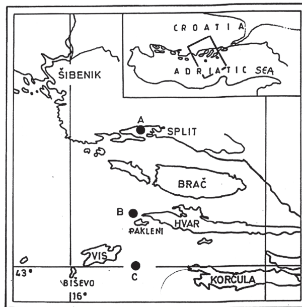
Fig. 1. Study area and sampling locations of Chromis chromis in the middle Adriatic: A = Kaštela Bay, B = Pakleni Otoci Archipelago, C = Budikovac Islet

(234 females and 172 males) were sampled from commercial catches and subjected to biometric analysis. The sample was categorized into length classes.