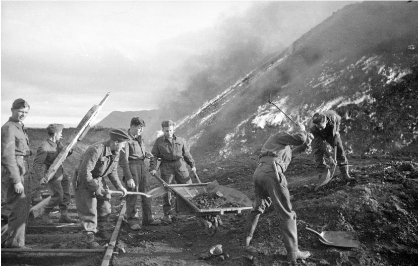
Royal Canadian Engineer sappers fire the coal pile at Barentsburg.