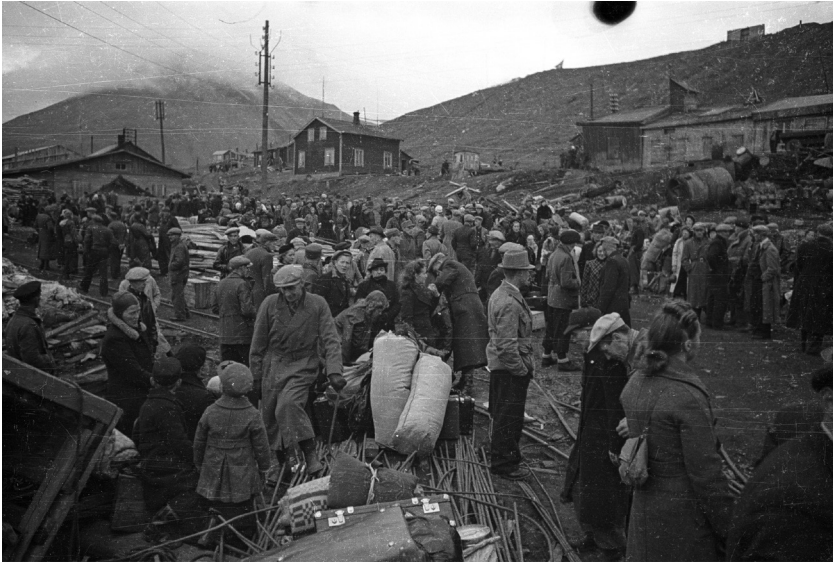
The Norwegians readying for evacuation from Longyearbyen.

conduct demolitions and collect miners and trappers, whom they concentrated at the main Norwegian settlement of Longyearby. The Norwegians manning the weather and wireless stations broadcasted false reports of heavy and persistent fog to discourage any German reconnaissance flights over the archipelago during the operation. The deception worked. 100