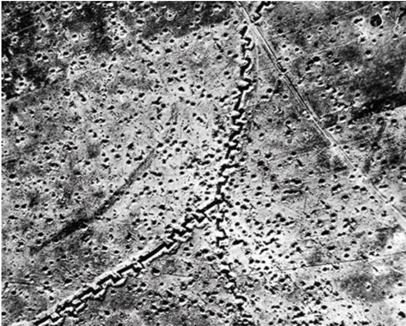
Junction of Regina and Kenora trenches.