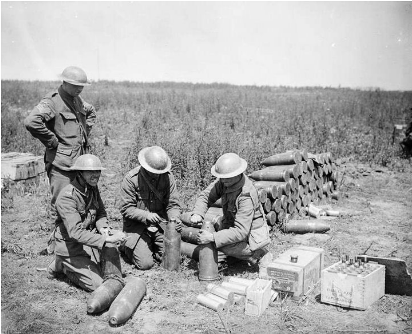
Troops of the Royal Garrison Artillery setting fuses of 6 inch howitzer shells in front of Montauban, July 1916..

of their trenches and advanced towards Regina Trench. The German artillery and machine gunners mowed them down, inflicting over 200 casualties in a matter of minutes. 102