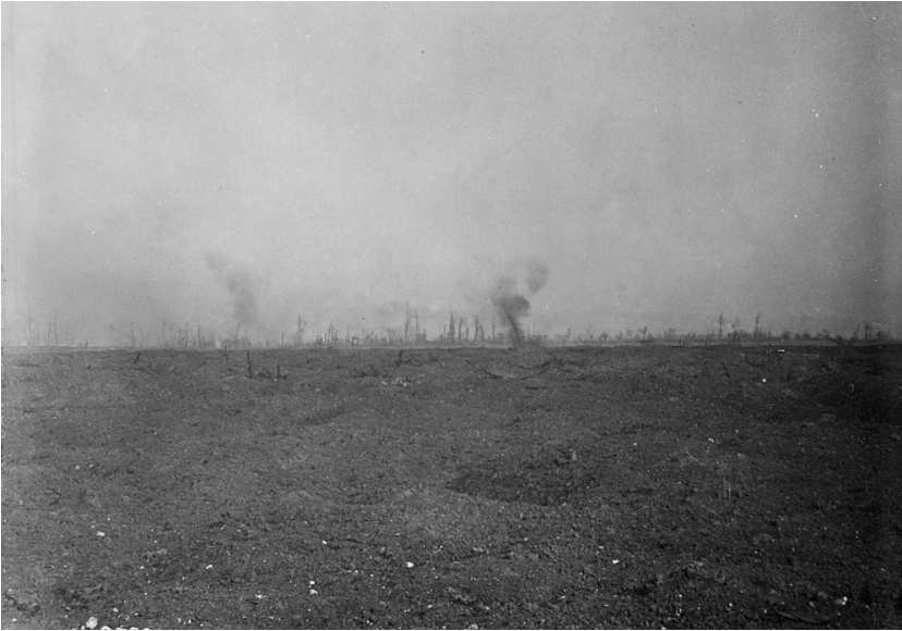
Courcelette being shelled during attack by Canadians.

1800 on 15 September, the guns commenced firing another creeping barrage to cover the attack by the 22nd (French Canadian) and 25th (Nova Scotia Rifles) Battalions to capture the village of Courcelette. 69 Although the creeping barrage suppressed German machine-gun fire, most enemy guns, largely unmolested by Anglo-Canadian counter-battery fire, remained in action throughout the battle and inflicted significant casualties upon the advancing infantry, although not enough to halt their attack. An after-action report written by the commanding officer of the 25th Battalion noted, “As we started our advance we came under artillery fire almost immediately but this did not in the slightest degree check or confuse our men. They marched that distance of 2200 yards as though they were on a General Inspection Parade.” 70 In a few instances, Canadian gunners working with the RFC pinpointed the location of German batteries and neutralized them before the infantry attack began. 71 But it was