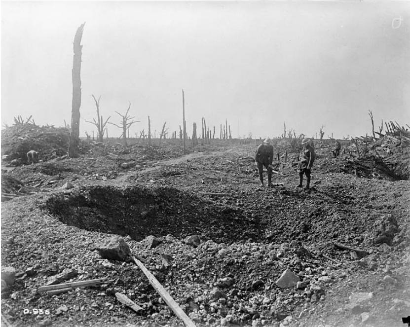
One of the roads to Baupame.

Battle of the Somme, there was an almost 100 per cent increase in the number of heavy artillery pieces in the Canadian Corps. The Canadians inherited the heavy guns from the 1st ANZAC Corps when they relieved the Australians, but most of the batteries were British, with a few Australian and Canadian batteries thrown in. 11 During the battle, the heavy artillery guns were grouped into batteries of four guns, which in turn were grouped into heavy artillery groups (HAGS) composed of a number of heavy and siege gun batteries and commanded by a lieutenant-colonel. The commander heavy artillery (CHA)—a brigadier general—wielded a number of HAGS at the corps level. The heavy artillery consisted of the 60-pounder and 4.7-inch guns. All other large artillery pieces, from the 6-inch howitzers and guns up to the 15-inch howitzers, were classified as siege artillery.