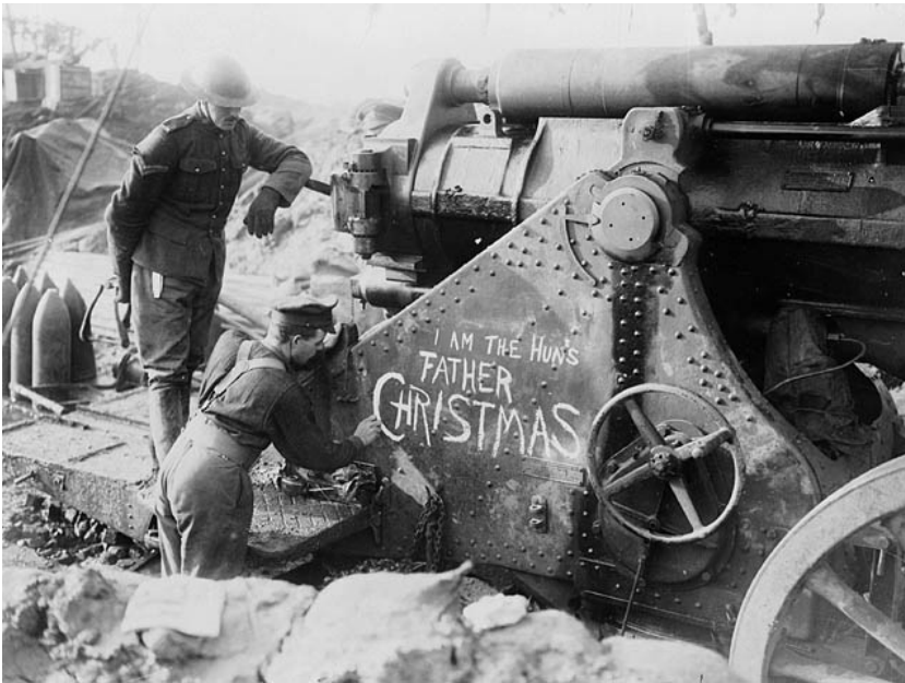
A heavy howitzer on the Somme.

exceptionally heavy casualties.” 10 The heavy casualties sustained during the Battle of the Somme certainly validated Brooke’s claim.