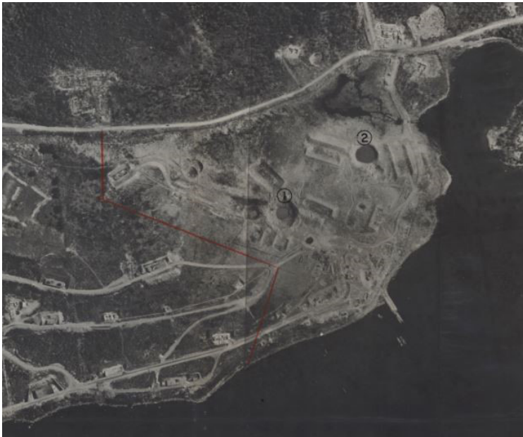
Photo 4 Aerial photograph of the Bedford Magazine in August 1945. Note the destruction and the locations of the two major craters.