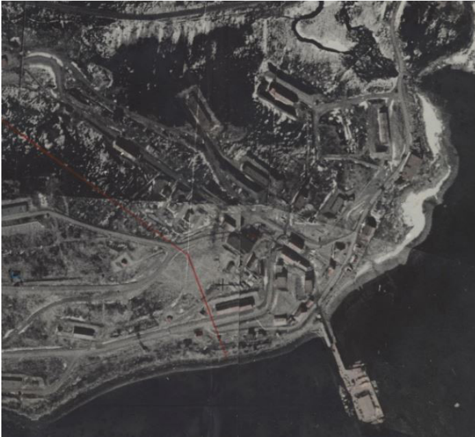
Photo 3 Aerial photograph showing the Bedford Depot in March 1945. Note the number and locations of the buildings and south jetty.