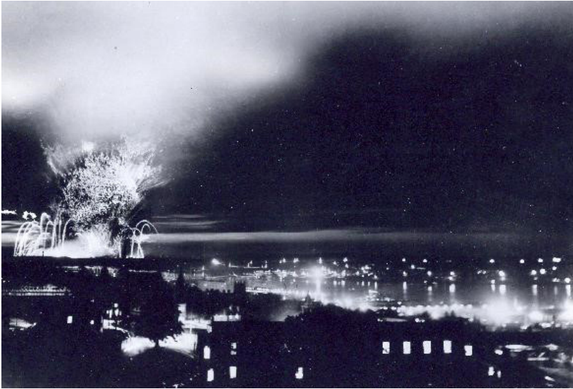
Photo 1: The Bedford Magazine Explosion at night.

people. 1 However, the Bedford Magazine Explosion was nonetheless an important turning point in the history of Canada's postwar demobilization.