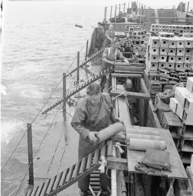
Photo 5: On arrival at the ammunition dumping ground off Cairnryan, members of the Royal Army Ordnance Corps place shells on gravity rollers that take the ammunition over the side of the ship and into the sea.

traversed and the cargo was dispersed over a wider and unrecorded area. 85