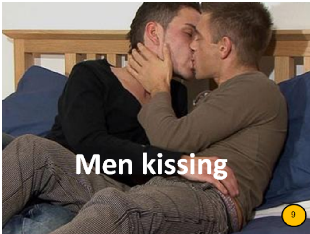
Figure 1: Explicit photographs and text cards

were not inclusive of queer and trans sexual relations. As a result, some of our participants may have had a harder time relating to them.