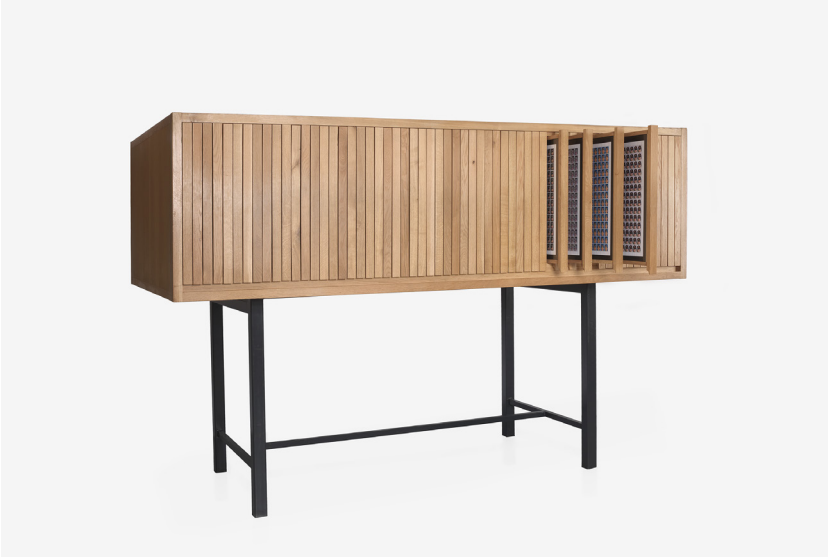
Figure 8. Steve McQueen. Queen and Country (installation view). 2007. Artist stamps and casement.