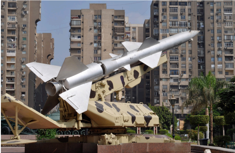
Figure 3. Dick Aaverns. October 1973 War Panorama (Cairo) , 1/5 2009. Archival digital print on aircraft grade aluminum. 40" x 60". [Private collection]

eventual reclaiming of the Sinai peninsula as part of the Yom Kippur War. Egyptian President Mubarak had seen a similar panorama in North Korea in the early 1980s and was inspired to seek North Korean support to build a panorama in Cairo. 22 The venue has echoes of socialist realism but is undeniably emotive, comprising a central 360-degree painting replete with revolving auditorium, exterior wall reliefs and a landscape of military hardware (Fig 3). The works are at once monuments and propaganda; representational murals, figurative reliefs and monolithic relics all relate to many ongoing commemorative war art practices.