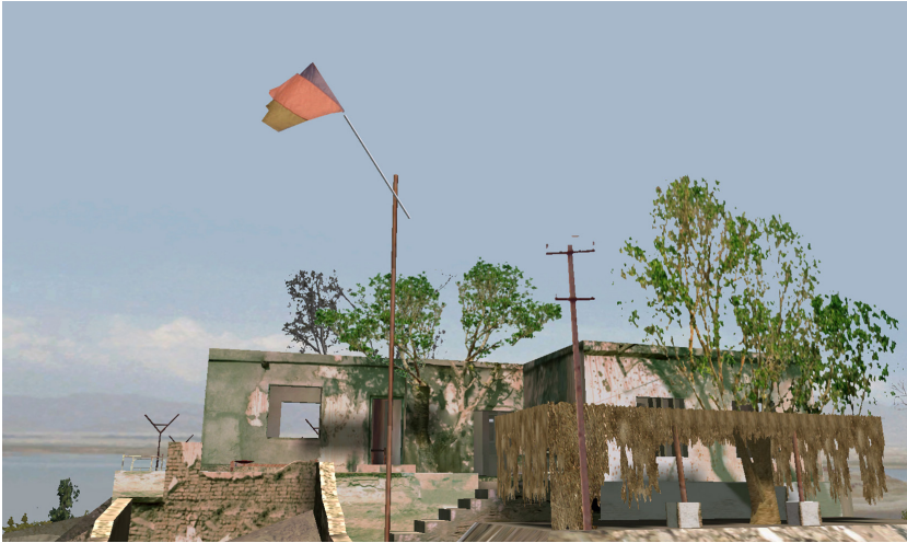
Figure 7. Langlands & Bell in association with Tom Barker V/Space LAB. The House of Osama bin Laden , (detail). 2003. Digital installation. [Courtesy of Langlands & Bell]

a military wing, allows for a high degree of artistic freedom and innovation, as indicated by their recent projects linked to the GWOT.