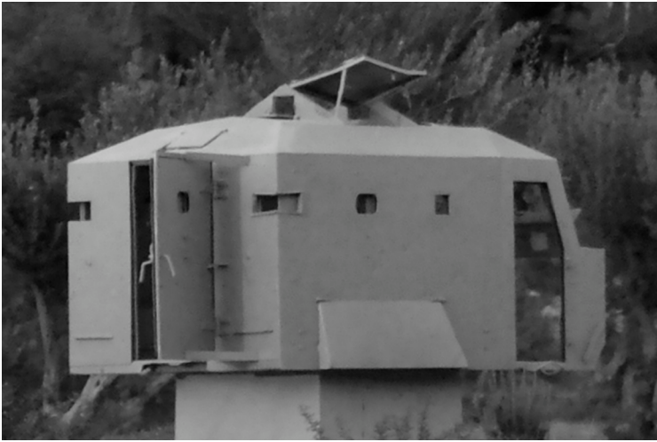
Figure 5. Unknown. Israeli roadside memorial to Colonel David “Mickey” Marcus’s 1948 military “Burma Road” construction supporting convoys to relieve siege of Jerusalem. Highway 1, near Latrun.

for art in this army!” 23 This aside, in touring the museum, I found reference to some major sculptural memorials located near Latrun on Highway 1 between Jerusalem and Tel Aviv that I subsequently visited and photographed. Here, not far from the West Bank, one finds a commemorative work in a series of stripped-down armoured cars from a 1947-48 mission led by Colonel David “Mickey” Marcus during the First Arab-Israeli War (Fig 5). The museum text panel tells us: “The vehicles on the roadside...bear witness to the gallant men who lost their lives attempting to get supplies to the beleaguered city of Jerusalem.” 24