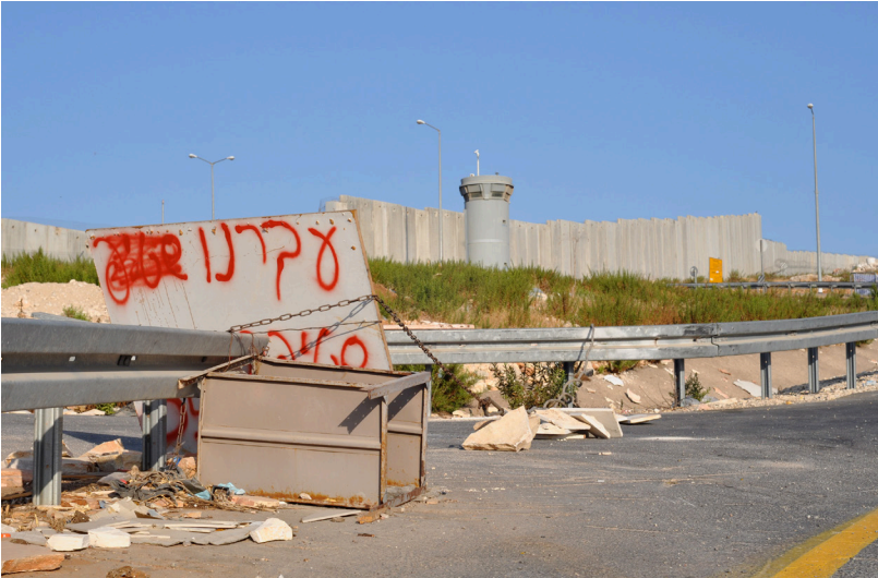
Figure 4. Dick Averns. Lookout (West Bank) , 1/5 2009. Archival digital print on aircraft grade aluminum. 24" x 36" caption. [Collection of the artist]

objective sculptures for government buildings. As part of a practice better considered as military art, Ayman and his peers tend to work toward fulfilling design briefs rather than creating their own content. So while subject matter is overtly patriotic, conceptual and critical value is limited. Artists are paid full-time wages and guaranteed an audience for their work, albeit art of the state rather than art destined for a contemporary gallery.