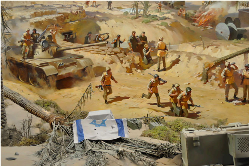
Figure 1. October 1973 War Panorama (detail) c. late 1980s by Egyptian and North Korean military artist team. 360 degree panorama painting and diorama.

canons. 2 Put another way, the greater the degree to which a country fosters critical artistic enquiry in the realm of military conflict, the greater the hope for a functioning liberal democracy. 3 For instance, in Egypt, only a year before the so called “Arab Spring,” the country’s official war art featured art of the state: uniformed military personnel operated as artists and took on commissions for government buildings and maintained historic murals of victorious battles (Fig 1). 4 In contrast, Canada has professional civilian artists that are afforded