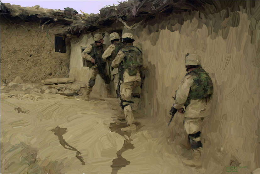
Figure 9. SFC Darrold Peters. Knock Knock , 2006. Digital Oils, Corel Painter IX.5. [U.S. Army Center of Military History. In United States Army Art Collection, Sergeant First Class Darrold Peters, Online Gallery Exhibit, http://www.history.army.mil/art/peters/peters2.htm (accessed August 5, 2016)]

illustrative (Fig 9). Similar to Egypt, this work appears more as military art rather than contemporary, critical war art. Further, this program does not enable civilian deployment. This is in contrast to the program's antecedent; the WWII Life magazine artists were civilians who received the same War Department access afforded to journalists and film correspondents. 44 That being said, I am aware that freelance artists can request Afghanistan access (at their own cost) through International Security Assistance Force Public Affairs. But this of course is not specific to depicting US Forces.