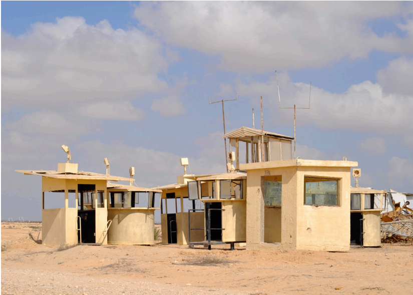
Figure 2. Dick Averns. Retired Observation Posts (MFO North Camp Sinai) , 1/5, 2009. Archival digital print on aircraft grade aluminum. 40" x 56.5". [Collection of the Artist]

frontline access with the opportunity for self-representation and the adoption of more nuanced approaches (Fig 2).