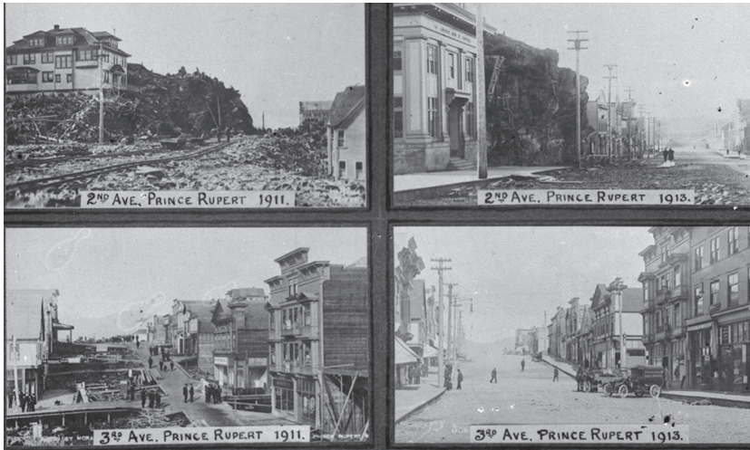
4 views of Prince Rupert, B.C.