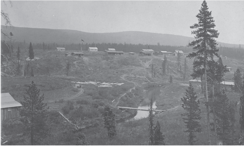
General view of Pacific Pass Coal Mine, Alberta, June 1912.