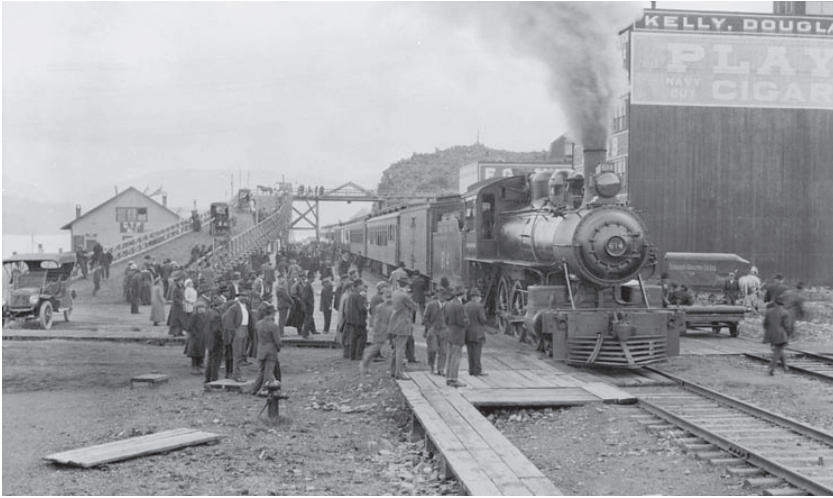
G.T.P. train (614) for Winnipeg, Manitoba at Prince Rupert, B.C., 1915.

adventurism that characterised the underside of the Laurier boom. Given the general collapse of expectations for the Prince Rupert economy in the years immediately preceding the First World War, and its failure ever to achieve the high expectations that were once entertained for it, one must wonder about the fate of investors who actually bought into the company.