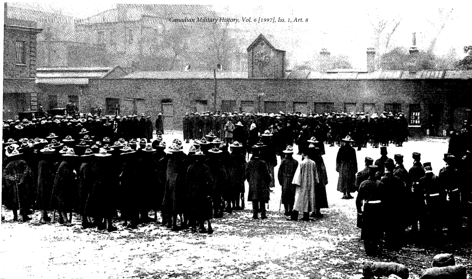
Strathcona's Horse in London prior to their return to Canada. Lord Strathcona is visible in the centre of the photo, white-haired and hatless, while Lieutenant-Colonel S.B. Steele stands to his left, with his back to the camera.