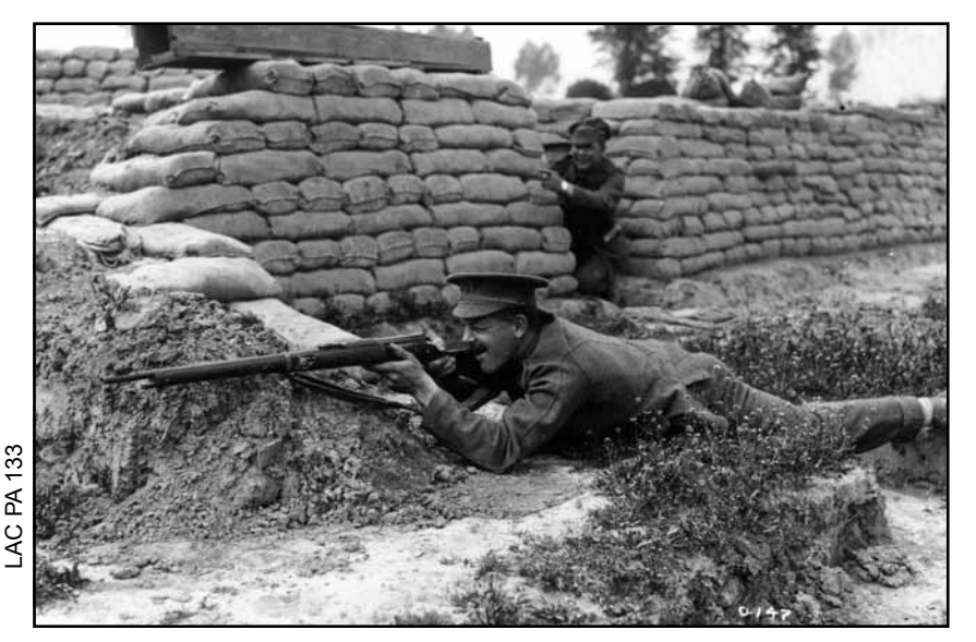
Left : A Canadian soldier practices his musketry skills, June 1916.

Below : Testing a Vickers Machine Gun, September 1916