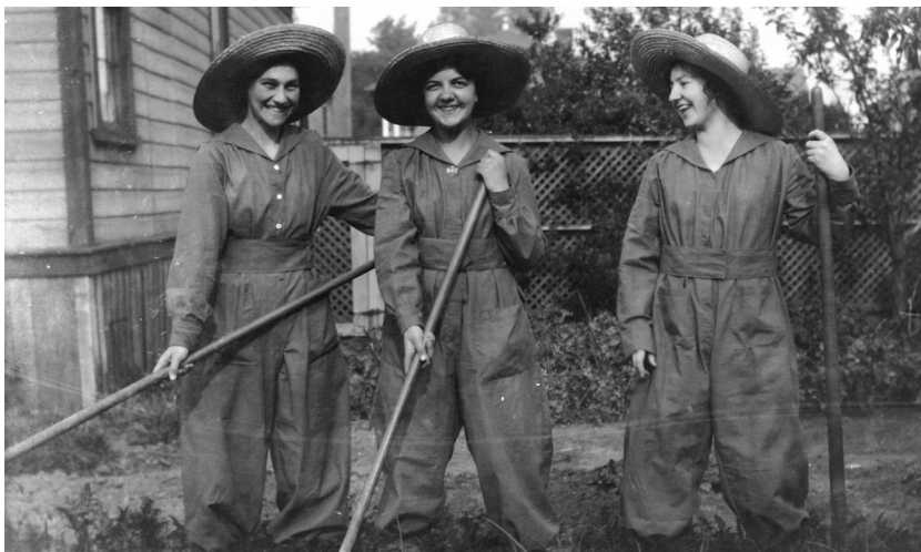
The Home Front: Victoria High School Victory Garden.

have been covered in that town or city. I found that memorials in our Christ Church Cathedral in Victoria was as all inclusive as it could be in listing names on the Roll of Honour, and perhaps as many who had served and were members of the diocese were listed there, not just those who were on the lists of the parish. For the benefit of future researchers, in your book be sure to include a bibliography and also supply an index. Make sure teachers and librarians know about the project, and if they are interested they may be able to motivate students to take part in useful research and story telling. Studying the lives of individuals going to war can be a most rewarding experience in historical research. But look out for creative non-fiction enthusiasts here, for I have seen instances in which a teacher may well instruct the student to write up the war history of an individual soldier and then find that all sorts of non-verifiable detail has been added to fill out the story and provide colour. I am a great supporter of creative non-fiction, and was for fifteen years or more on the guiding committee for the Edna Staebler Prize in that line of writing, at Wilfrid Laurier University, but invariably the end results are not history or biography and are often escapes of fancy.