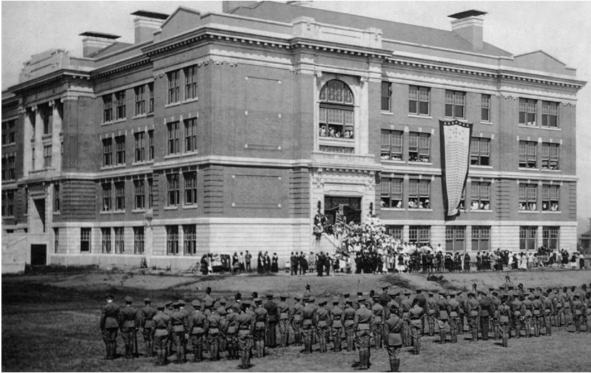
A memorial service in 1920 featuring the nine-metre-high Banner of Honour and Sacrifice suspended from an upper window.

names who paid the ultimate sacrifice), the Roll of Honour (which lists all those known to have enlisted or otherwise gone to war), the Banner of Sacrifice and Remembrance (a Canadian cultural icon which shows a maple leaf for all known to have gone to war and indicates by colour those who did not come home), the memorial trees, the stained glass Laurels of Victory and Sacrifice (a laurel wreath embracing two poppies and surrounding vhs), and a unique memorial tree (The Kitchener Memorial Oak). I was blessed to have so much in the material line to work with. I think it important in a school's history to write and interpret such memorials as these. The preservation of these treasured artifacts is important for the future of Canadian civilisation, for they tell how another age memorialised sacrifice and victory in the years immediately after the Armistice. Such artifacts do not exist at the school for the Second World War, save for a tablet of names of those killed and a Memorial Stadium: Track and Playing Field. I learned from reading in books about memory and monuments of valour that how societies memorialised the Second World War was quite different from how they memorialised the Great War. My school is a good example of this change of attitude and esthetics, and it is likely that other schools will demonstrate similar patterns.