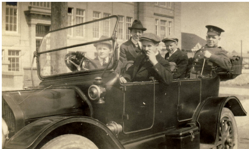
Members of the Victoria High School Boys' Debating Club en route to a competition at King Edward High School in Vancouver.

Professor of Classics, University of Victoria. 5 The current building (of handsome beaux arts design), which contains the war memorials, was opened officially on 1 May 1914 and is actually the fourth of the buildings that have housed our school since its inception. Victoria High School is the oldest publically funded and non-sectarian high school west of the Great Lakes.