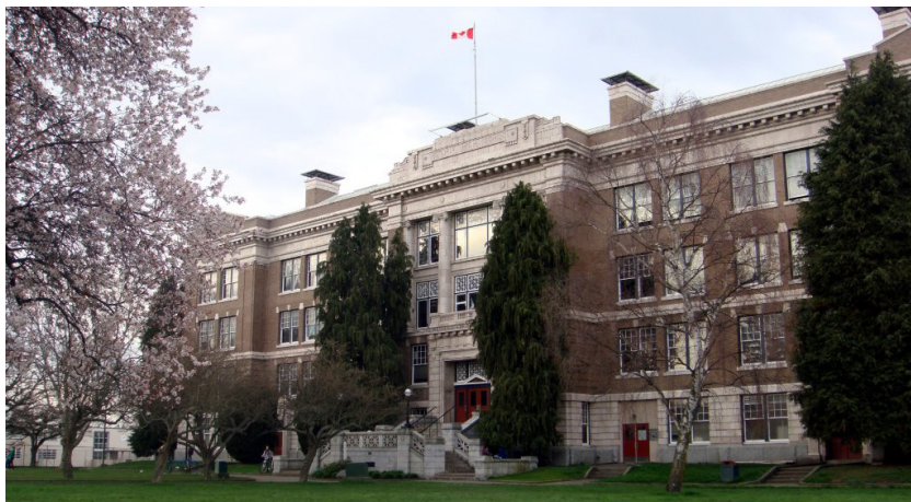
Victoria High in 2010.