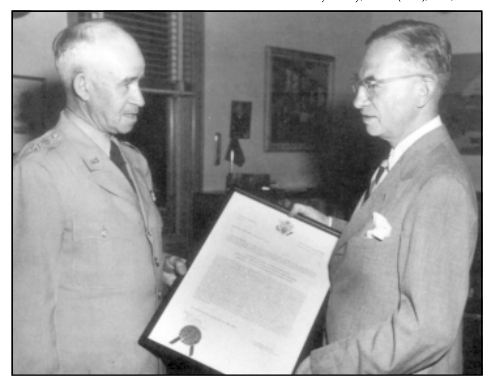
under the most unusual circumstances. Only on rare occasions will a unit larger than a battalion qualify for the award of this decoration.<sup>18</sup>

As stated in the definition, a unit award is given to an entire unit for heroism as well as accomplishment of a particular mission. Its purpose is to recognize a group effort, not individual acts of heroism. Typically the citation is distinguished by a streamer on the unit colours and emblems worn by individual members of the unit.