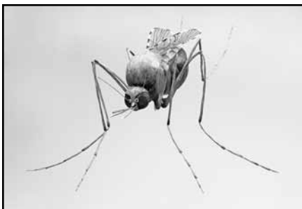
Above: Malaria-carrying mosquitoes have destroyed armies since antiquity and, despite the introduction of preventative drugs, still threaten military forces. Malaria remains the world's most common cause of death from infectious disease.