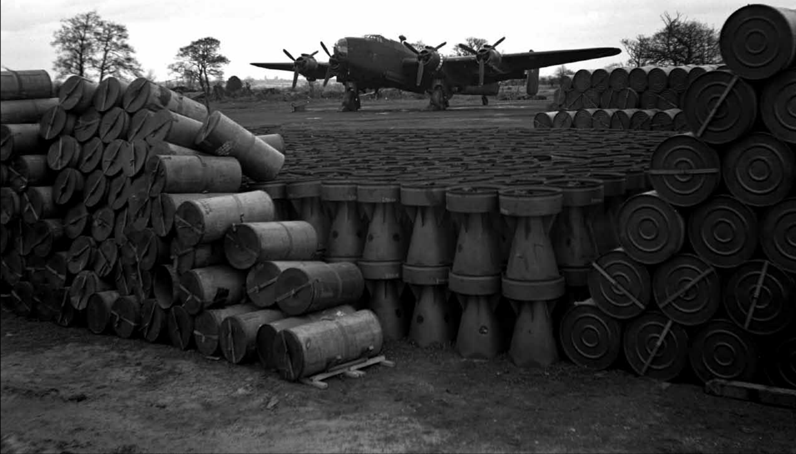
A Canadian Halifax awaits its next mission. In the foreground sits the cache of deadly bombs.

began to seriously erode Germany's capacity to re-arm itself at least as early as Operation Pointblank in February 1944 – a date that was certainly not "late in the war."