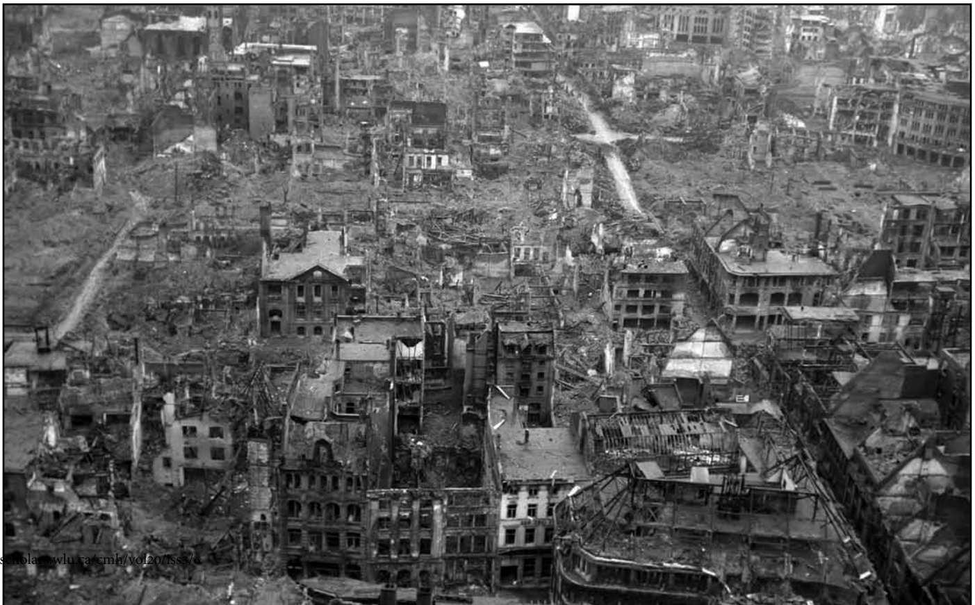
The German city of Cologne, smashed by Allied bombing, as it appeared in 1945 .