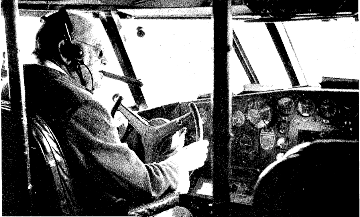
Churchill at the controls of the Boeing Flying Boat which carried him across the Atlantic on 14 January 1942.