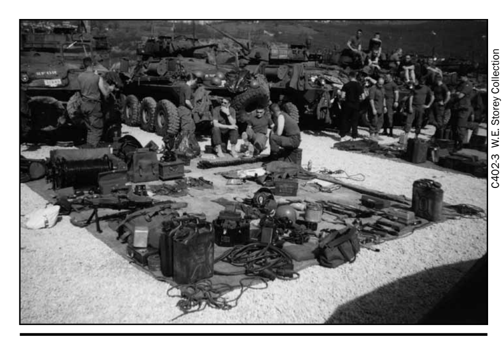
Canadian LAV Coyote Reconnaissance Vehicles with NATO SFOR (Stabilization Force) at Velika Kladusa, Bosnia, March 2001. All of the equipment that is issued with the vehicle has been laid out for inspection.

To put the vehicle into context, the M113 series has been one of the most successful tracked vehicles in history with over 80,000 being produced since its introduction in the early 1960s. This vehicle series has been