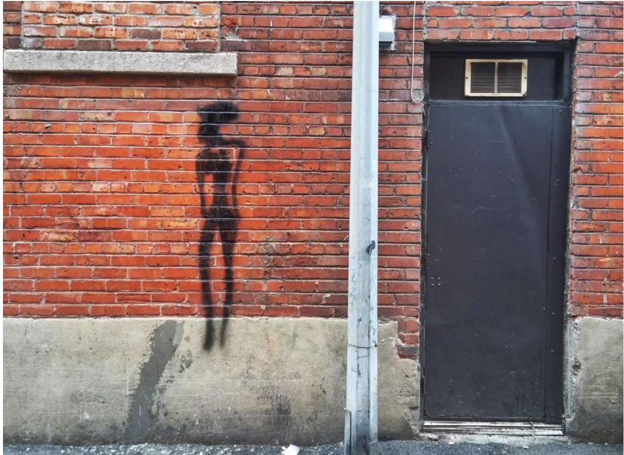
Graffiti Ruelle Montrealaise