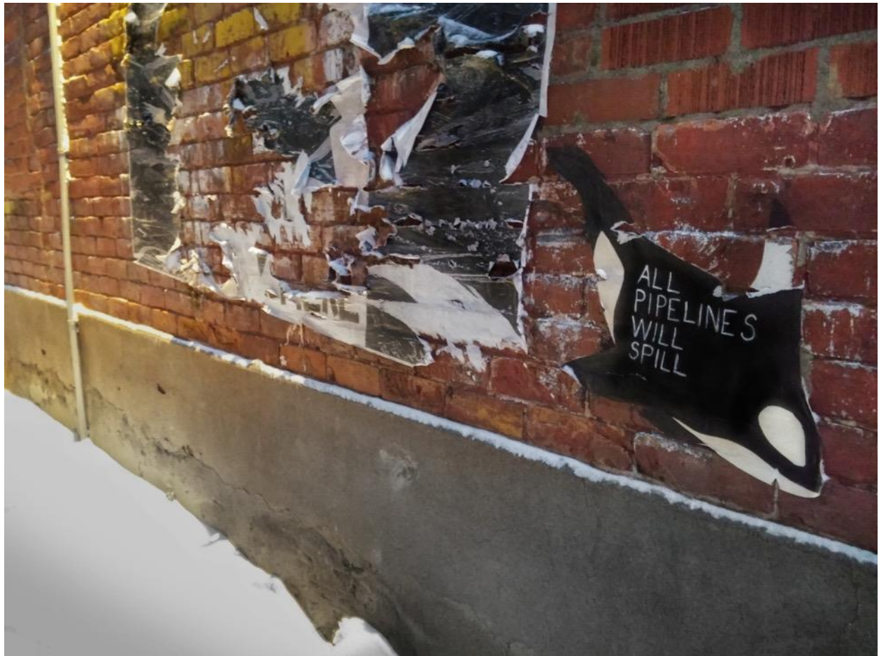
All Pipelines Will Spill wheatpaste