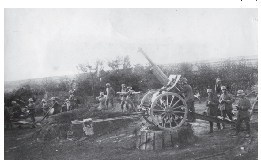
Anti-aircraft guns during the battle of Arras, ca. April-May 1917.

to engage the heavy guns at once. (Comparatively speaking, each battery of 10th Bavarian Artillery Regiment on 9 April had fired roughly 1,500 shells.) Ludendorff ruled out failure on the part of the soldiers: "The bravery of our troops remains firm."<sup>39</sup>