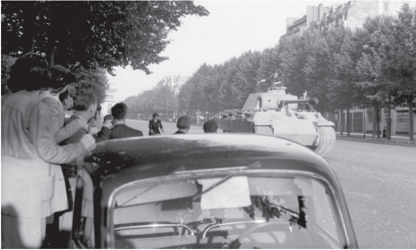
A Panther travelling at high speed through Paris en route to Normandy, summer 1944.

which was five kilometres per hour faster than a Sherman. 15 The US Army extensively test-drove captured Panthers in Normandy, films of which exist online. The tanks in question appear to be driven quite hard and fast. 16 US forces in late 1944 and early 1945 reported that in tank versus tank engagements with weak German armoured forces, the Panther had shown remarkable manoeuvrability in contrast to the US Sherman. 17