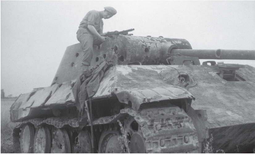
3rd Company SS Panzer Regiment 12 Mark A Panther destroyed near Norrey-en-Bessin, France on 9 June 1944 and later used as target practice.

two severely damaged in ten minutes. 56 Due to these heavy losses, on 14 June 1944 the 3rd Company handed over all its remaining tanks in order to be re-equipped back in its former garrison of Le Neuborg, 140 kilometres to the south east.