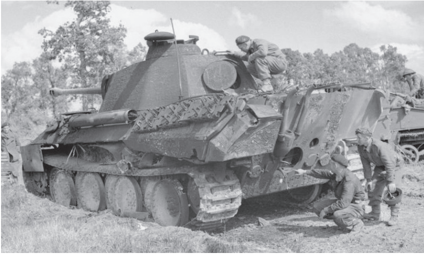
Destroyed 2nd Company SS Panzer Regiment 12 Panther Mark A being inspected by the Durham Light Infantry near Rauray, France, 27 June 1944.

staff group and light repair groups. The second, main supply group consisted of transport vehicles that carried fuel and new equipment from army-level depots back to the panzer regiment. The last group was a rear group, whose duty was supplying the needs of the workshop platoon. 73