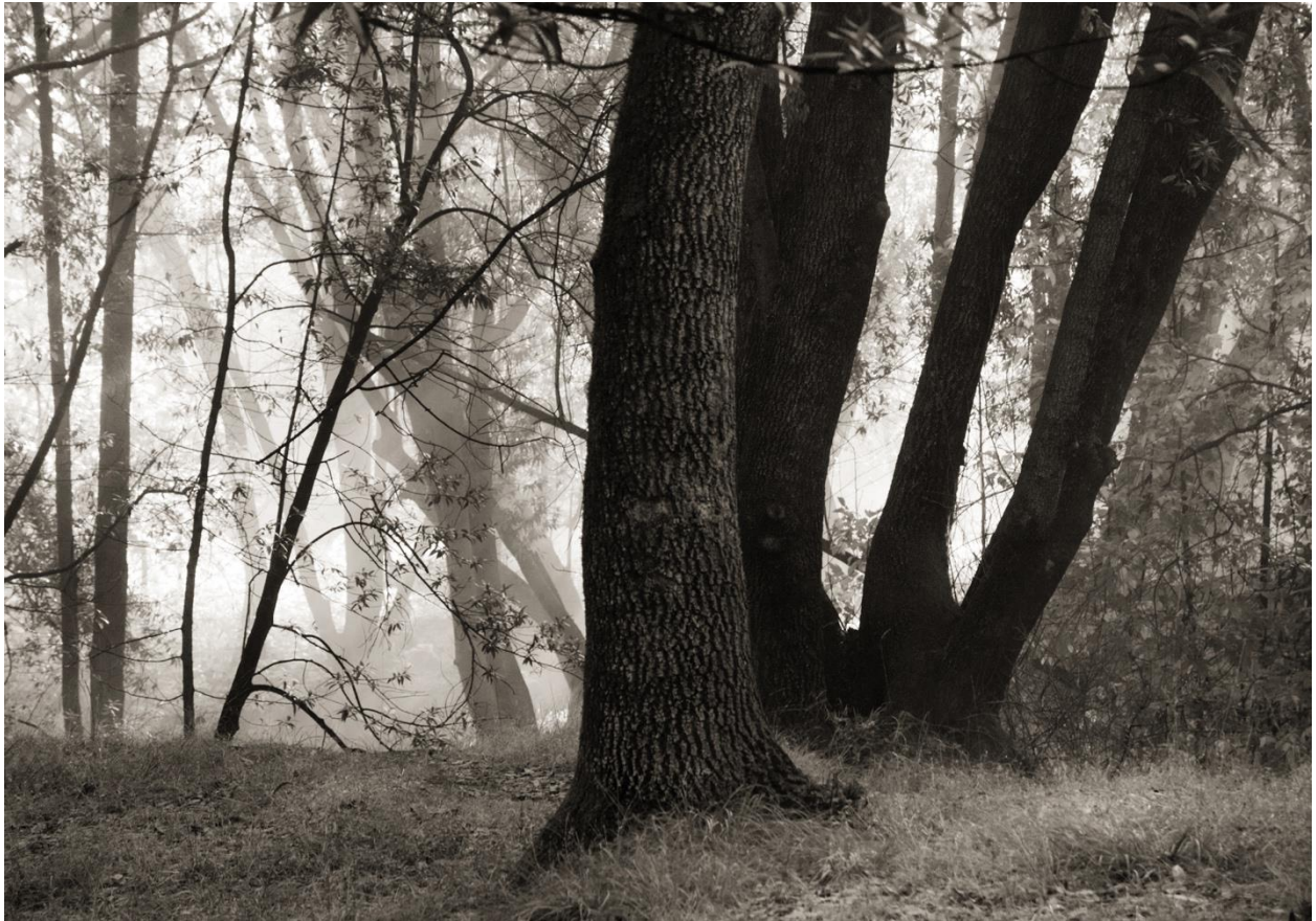
Foggy Morning, Bay Laurel and Live Oak Forest, 2015, Chase M Clow

As I contemplate ways of radicalizing my own little valley and begin the practice of right relations, I'll continue to tenderly engage with the trees. They have communicated something so vital already. What else might they reveal?