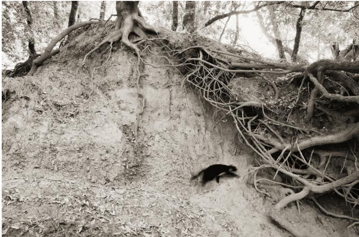
Bay Laurel Roots 3, 2015, Chase M Clow

I wonder, who have these trees known? Who have they nourished other than those who still rely upon them: Columbian black-tailed deer, broad-footed mole, coyote, wild turkey, ornate shrew, dusky footed wood rat, acorn woodpecker, northern flicker, and a plethora of other species, including that bird who calls out so hauntingly in the night? Who might have fallen in love under their branches, buried a secret beneath their roots, or leaned against them with purple-stained hands after blackberry picking?