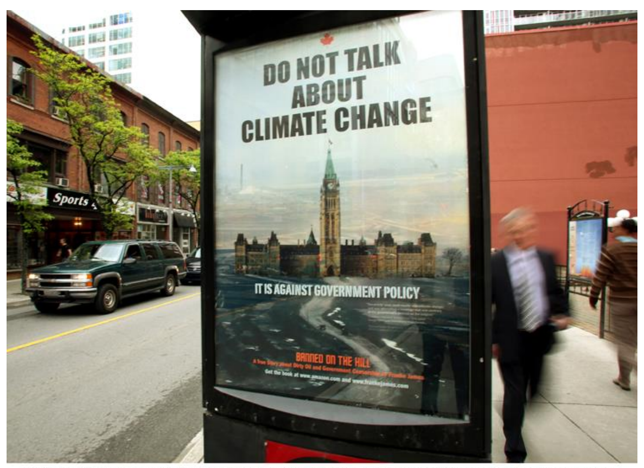
OTTAWA May 29, 2013: Do Not Talk about Climate Change poster by artist/author Franke James. The street poster exhibition and online media campaign was crowdfunded at Indiegogo. Project: BANNED ON THE HILL

In essence they were telling me "Do Not Talk about Climate Change. It is against government policy." I created a poster with the Parliament Buildings dropped into the tar sands.