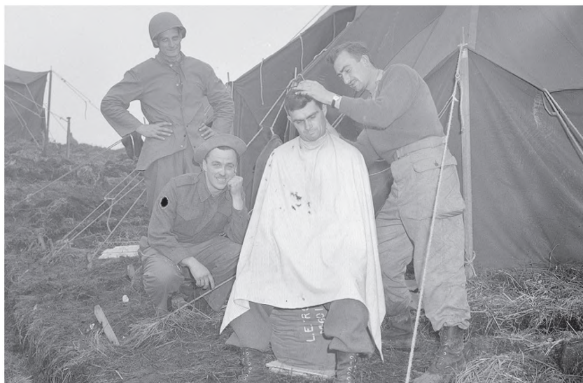
An unidentified infantryman of Le Régiment de Hull getting a haircut, Kiska, Aleutian Islands, August 1943.