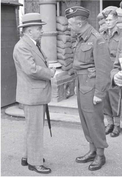
Rt. Hon. W.L. Mackenzie King talking with Major-General G.R. Pearkes during a visit to the 1st Canadian Infantry Division.