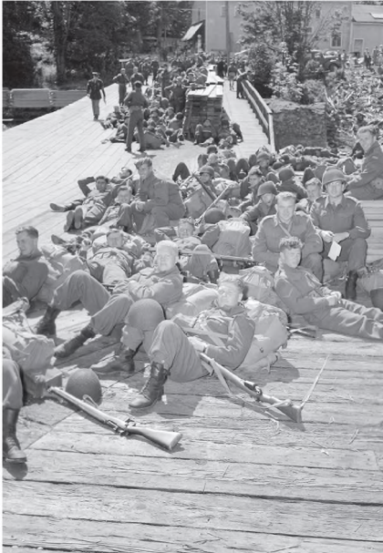
Infantrymen of Le Régiment de Hull waiting to board ships taking part in Operation COTTAGE, the invasion of Kiska, Aleutian Islands. Nanaimo or Chemainus, British Columbia, Canada, 12 July 194.

between all officers” in 14th FCT regardless of language, as it had been “sometimes difficult to keep racial and language friction under control” among ORs, “teams should be made up as far as possible from either all English speaking or all French speaking personnel.” 94