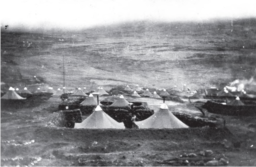
Canadian Army camp at Kiska in the Aleutian Islands, August 1943.