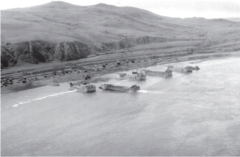
Canadian and US forces landing at Kiska, August 1943.