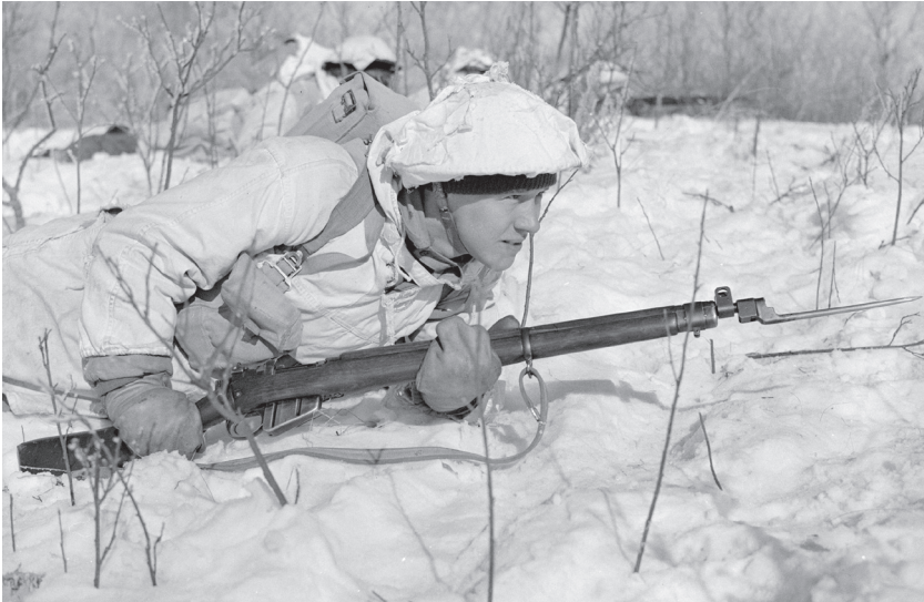
Canadian parachute-qualified personnel who will be posted to the 1st Canadian Parachute Battalion undertaking winter infantry training at A-35 Canadian Parachute Training Centre (Canadian Army Training Centres and Schools), Camp Shilo, Manitoba, Canada, 20 March 1945.

experienced during the exercise did at times drastically increase the rate of heat loss in participating troops.