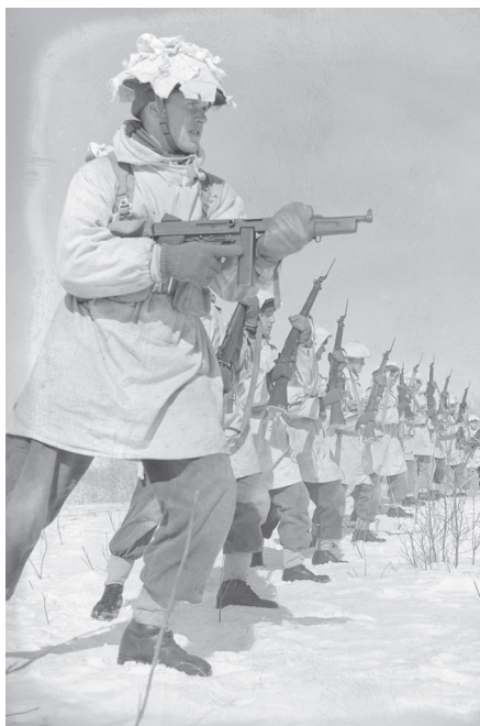
Canadian parachute-qualified personnel who will be posted to the 1st Canadian Parachute Battalion undertaking winter infantry training at A-35 Canadian Parachute Training Centre (Canadian Army Training Centres and Schools), Camp Shilo, Manitoba, Canada, 20 March 1945.

legacy while also contributing to a growing international literature on human and environmental science in the early postwar period. Sun Dog One represents an ideal case study. During the exercise, scientists tested the physical and mental qualities of troops operating under severe cold-weather conditions. The experiments were part of an Arctic acclimatisation research and indoctrination training programme, initiated to isolate the ideal male characteristics of cold-weather soldiery. In turn, Canada's defence and military establishment attempted to develop a process to isolate men deemed physically and mentally valuable to support a northern defence. Sun Dog One consequently provides a unique window into the development and impact of Cold War soldiery, an intriguing topic about military masculinity that provides many insights for Canadian historians and raises important questions about the ethics of human testing and defence science in the years immediately following the Second World War.