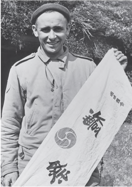
Winnipeg Grenadier POW displaying a Japanese flag after his release from prison, 1945.

(a) Any Hong Kong Prisoner of War Presenting himself at a D.V.A. treatment institution must be examined by a doctor who will determine whether he should be admitted for observation, or treatment, or not. The veteran shall be given every benefit of the doubt and any symptoms or conditions which he may present that might possibly be related to his P.O.W. experiences would entitle him to admission for observation and treatment. If the veteran so desires, he may write the S.T.M.O. of the district in which he resides requesting an appointment with the appropriate Treatment doctor.