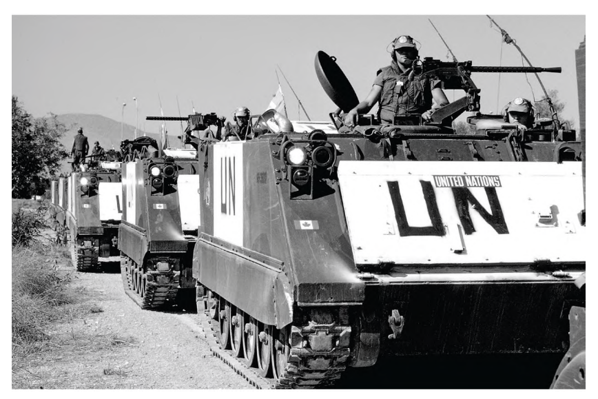
M-113 APCs of the Canadian Contingent on patrol near Nicosia. 28 August 1974.

alone, the bill topped $175 million.<sup>57</sup> Burdened by massive federal government deficits, Progressive Conservative Prime Minister Brian Mulroney struggled with the surging costs.