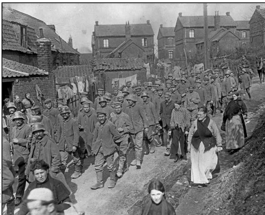
LAC PA 1160

Centre: German prisoners are marched to the rear after being captured at Vimy Ridge, April 1917. The prisoners are under guard of two mounted Canadian soldiers, and several local civilians have come out of their houses to catch a glimpse of the enemy.