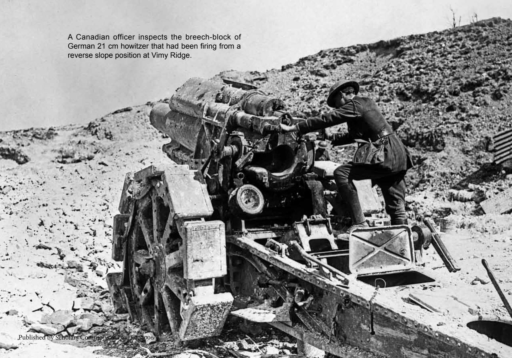
A Canadian officer inspects the breech-block of German 21 cm howitzer that had been firing from a reverse slope position at Vimy Ridge.