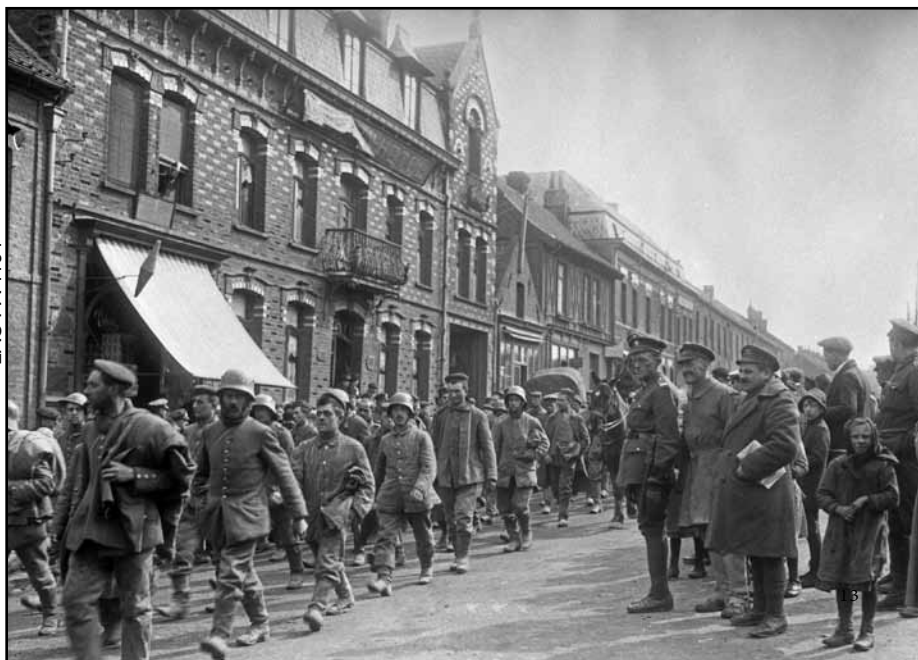
LAC PA 1191

Bottom right: German prisoners captured at Vimy are marched away from the battlefield under the watchful eyes of Allied soldiers and local children.