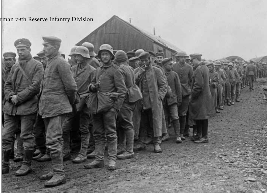
LAC PA 1190

Top right: German prisoners captured by Canadian forces during the Battle for Vimy Ridge. These men display an assortment of headgear, including soft field caps, knitted toques, M1916 steel helmets, and in at least one case, a Canadian trench helmet! The impact of the wartime ersatz economy is also evident, as some of the Germans wear puttees rather than the more expensive leather marching boots.