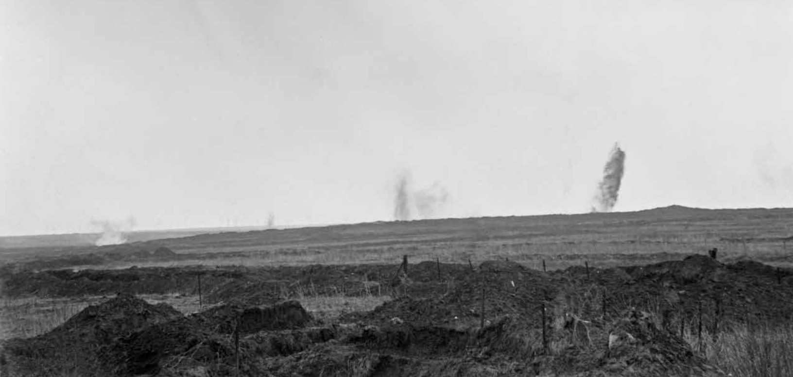
British gunfire falls on Vimy Ridge, April 1917.

case: in the 1st and 2nd lines there were 1 to 2 companies, and 1 to 2 companies behind that as a security force for the 3rd line, the rest stayed in reserve for the battalion commander. The trench strength of the companies varied between 50 and 90 riflemen. This shrunk considerably before the beginning of the big attack. Since the battalion reserves had shrunk down to a few groups because of Messenger posts, the Division had a company move forward into the battle zone from each reserve battalion immediately before the major battle, where they stayed with the Infantry Pioneer Companies as a weak reserve for the regiment. At the end of March, six machine guns of Machine-Gun Section 20 were deployed, and with the other machine guns hidden deeply in the cratered landscape. In conjunction with the few still operable mortars, they formed the solid skeleton of the very thinly manned positions.