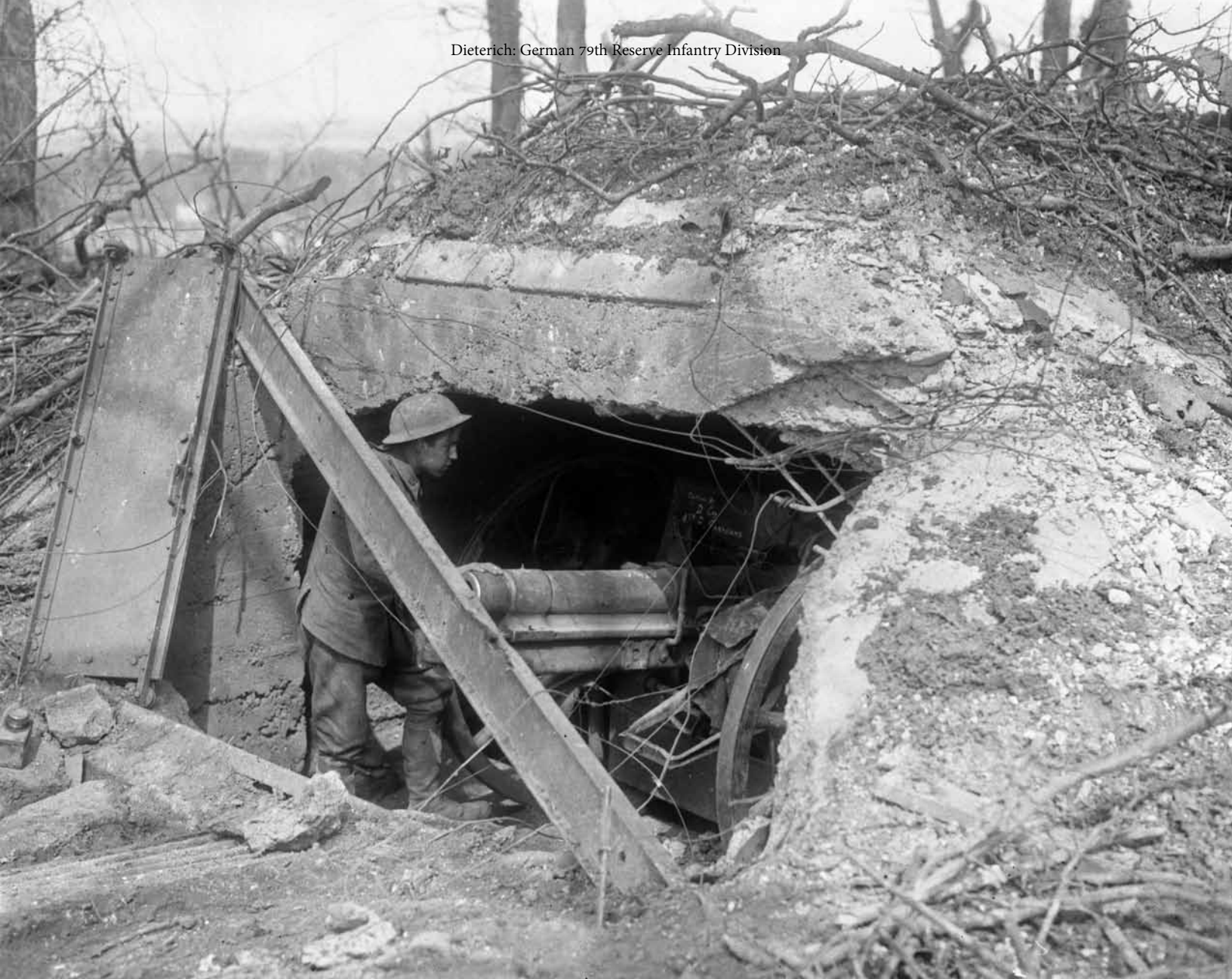
A Canadian soldier contemplates a German gun emplacement that appears to have sustained a direct hit from Allied artillery fire.

artillery munitions were fired than in the first week of the Somme and in the second week of Vimy six and a half times as much as in the second week of the Somme.