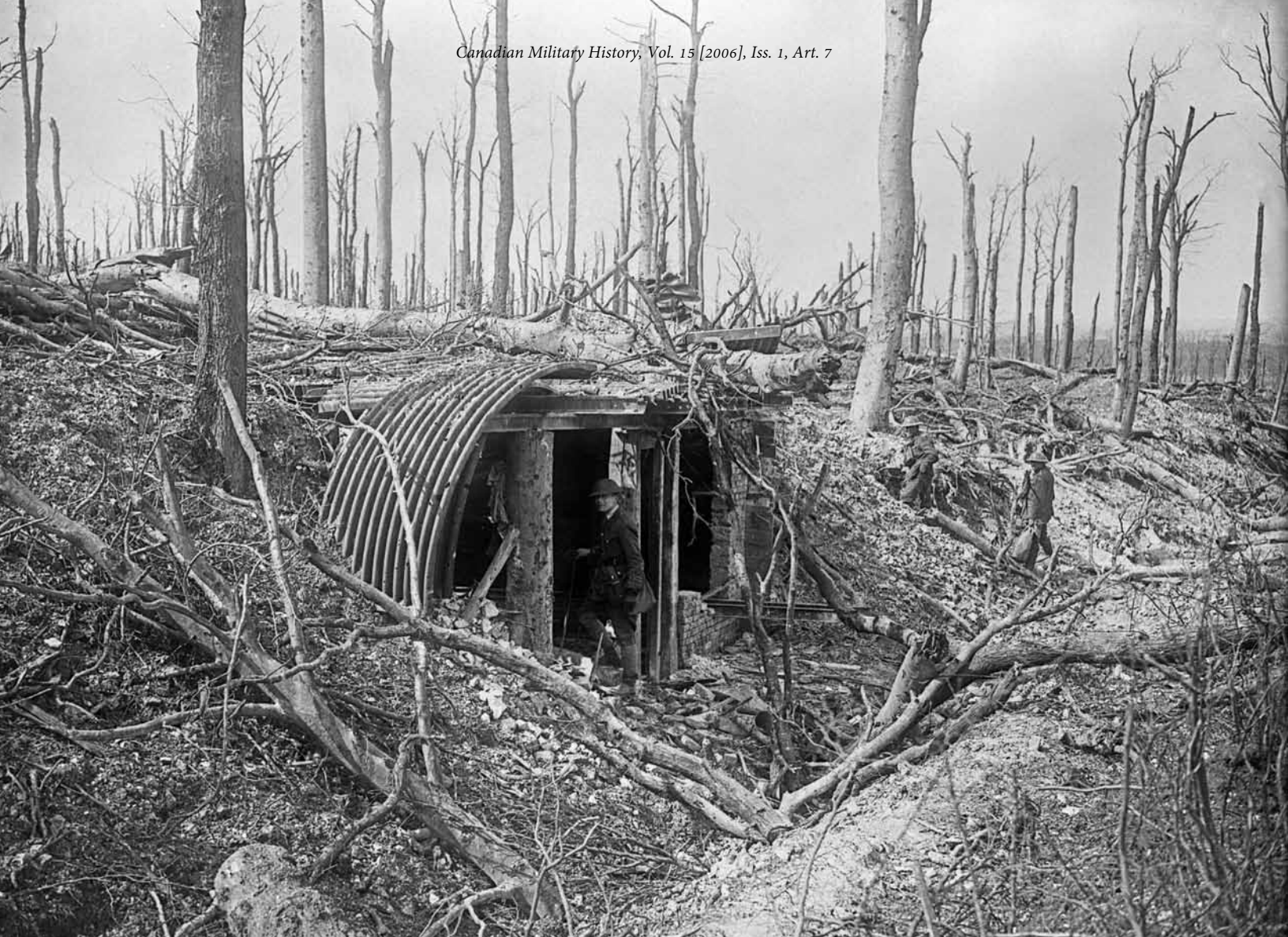
A Canadian officer explores a battered German shelter in Farbus Wood, April 1917. A network of German gun emplacements and underground shelters were concealed in the wood.

hearts to surrender. After brave opposition, the resistance of Section Arnulf was overcome.