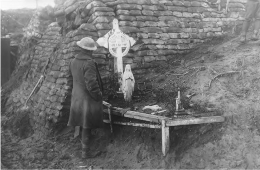
A Canadian at the graveside of a Canadian who was killed in 2nd Battle of Ypres - November 1917.

achievements had brought the Canadians immense gain in stature, for had they not proved themselves more than a match for the enemy and not less than the equal of their Allied comrades in arras. In their first major operation of the War Canadian soldiers had acquired an indomitable confidence which was to carry them irresistibly forward in the battles which lay ahead.