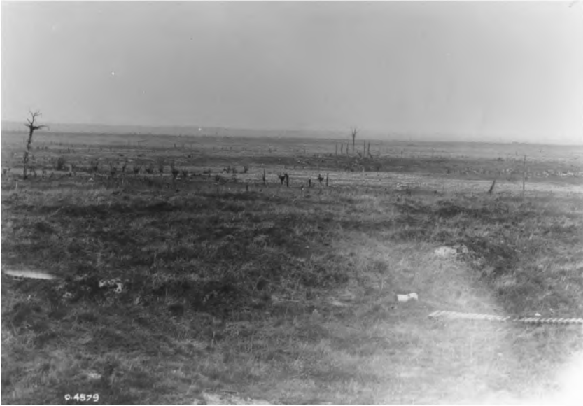
General view of ground over which Germans advanced after releasing gas, 22 & 23 April, 1915. Photographed in May, 1919.

another German force would cross the Canal and circle southward to cut off the line of retreat at Vlamertinghe while the Salient was driven in. It was to be the gravest threat to the security of General Smith Dorrien's Second Army.