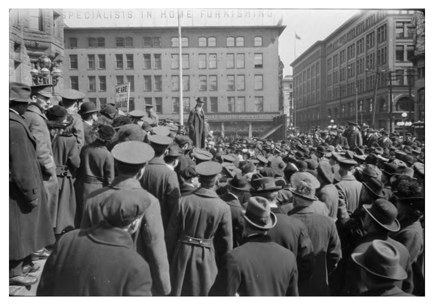
Recruiting soldiers in front of city hall. Toronto, Ontario, 13 March 1916.

in British Columbia. Tables I and II show the provincial distribution of men aged eighteen to forty-five and Table VI the estimated number of eligible men. Almost sixty percent of them lived in Ontario and Quebec.