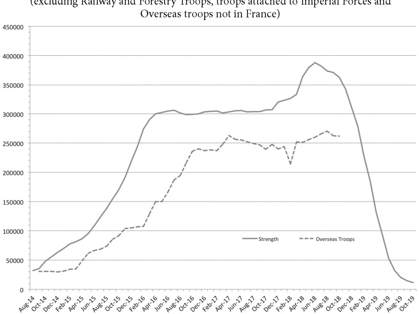
Figure I: Strength of the Overseas Military Forces of Canada (excluding Railway and Forestry Troops, troops attached to Imperial Forces and Overseas troops not in France)