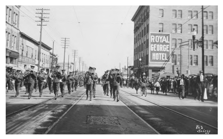
Edmonton's recruiting scene ca. 1914-15.

of the Military Service Branch indicated that 113,461 men were made available to the military authorities although a return to Parliament by the Militia Department in 1919 revealed that 124,588 men had been 'taken on strength' (Table VIII). Subtracting the 24,933 on leave for compassionate or farming-related duties, and subsequently discharged, and 16,300 struck off strength as liable only for noncombat duties "or of a category that ought not to have been order to report" leaving 83,355 men actually enlisted. This number has since been accepted as accurate although it understates the number of men made available.<sup>99</sup>