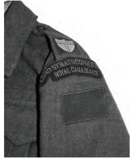
Distinguishing patches of the Lord Strathcona's Horse (Royal Canadians) in the Second World War. The rectangular patch is maroon for the 5th Canadian Armoured Division.