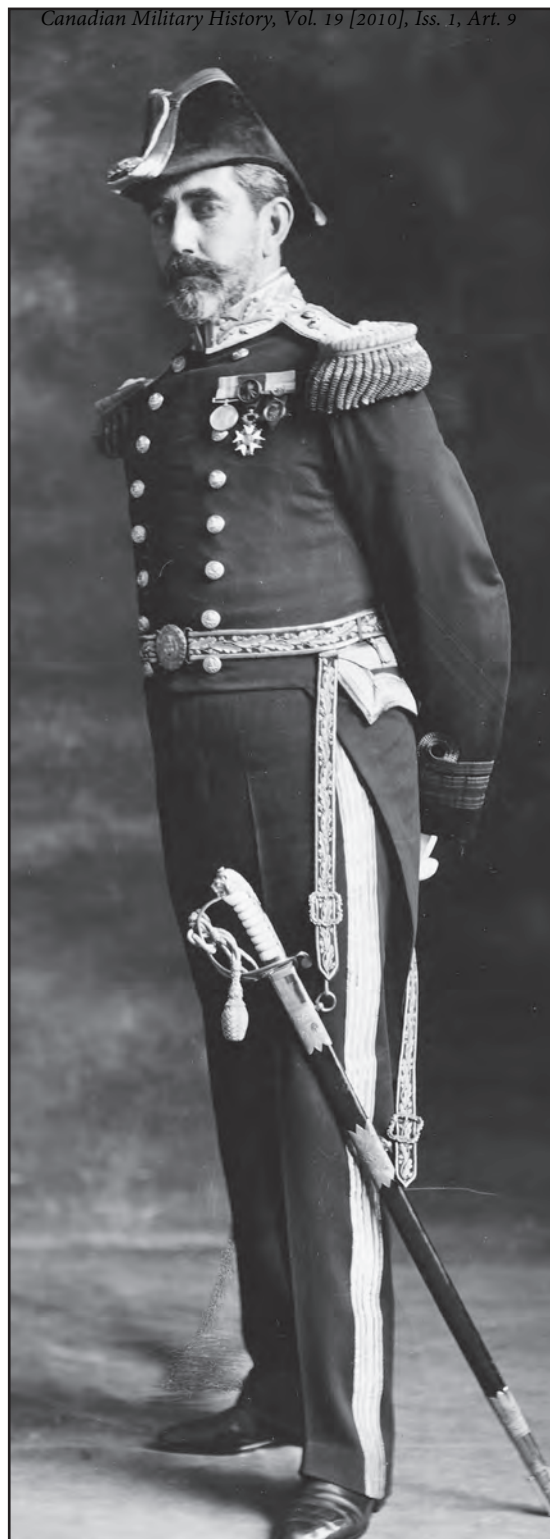
Admiral Sir Charles Edmund Kingsmill

By the early 20th century Britain looked to its self-governing colonies for naval assistance to meet increased international rivalry. Because of that rivalry the Royal Navy concentrated its fleet in European waters, closed the dockyards at Halifax and Esquimalt, and removed the warships permanently stationed in the western Atlantic and eastern Pacific at the end of 1904. Canada's prime minister, Sir Wilfrid Laurier, faced sharp disagreement between English-speaking Canadians who advocated defence cooperation with Britain, and French-speaking Canadians who believed that any form of naval initiative would be ultimately controlled by the British Admiralty which would draw the country into every British conflict overseas. Laurier's compromise was to develop the government's civil marine fleet, and particularly the Fisheries Protection Service, into a national navy for the defence of the oceans adjacent to the country's coasts. The dockyards at Halifax and Esquimalt, which Canada's department of Marine and Fisheries took over, were a valuable resource. Still, the government needed an experienced senior officer to lead the effort, specifically someone who was sensitive to Canadian demographics,