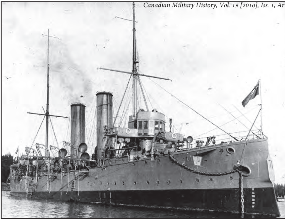
HMCS Rainbow at Esquimalt, BC.

cadets, leaving them to continue to serve in major British warships in more active theatres. He used his connections to find experienced Royal Navy officers, many of them retired, to organize and command the new small-ship anti-submarine flotilla.