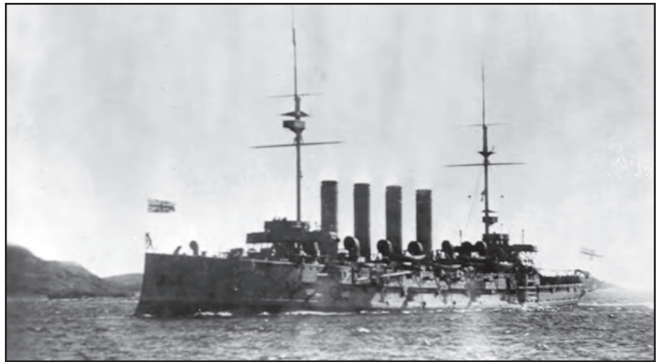
Top: Canadian Government Ship Canada as she appeared when completed by her British builders, Vickers Sons and Maxim, in 1904.