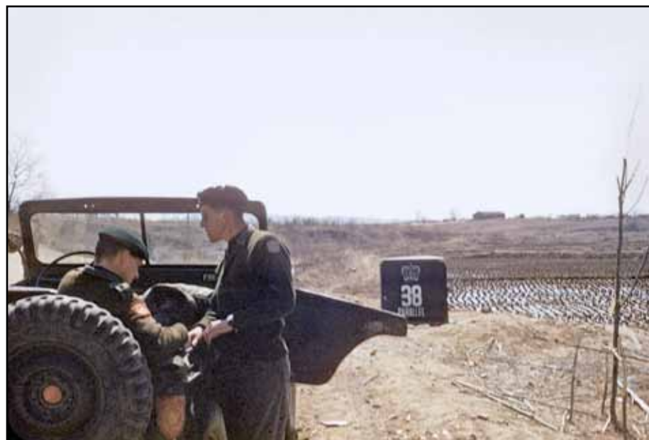
A trip to the 38th Parallel.

The Officers' Mess at the headquarters was British run and the meals were somewhat of a comedown from the unit where we had lavish US Army rations. In those days British catering was less than inspiring. The cooks did their best with what they