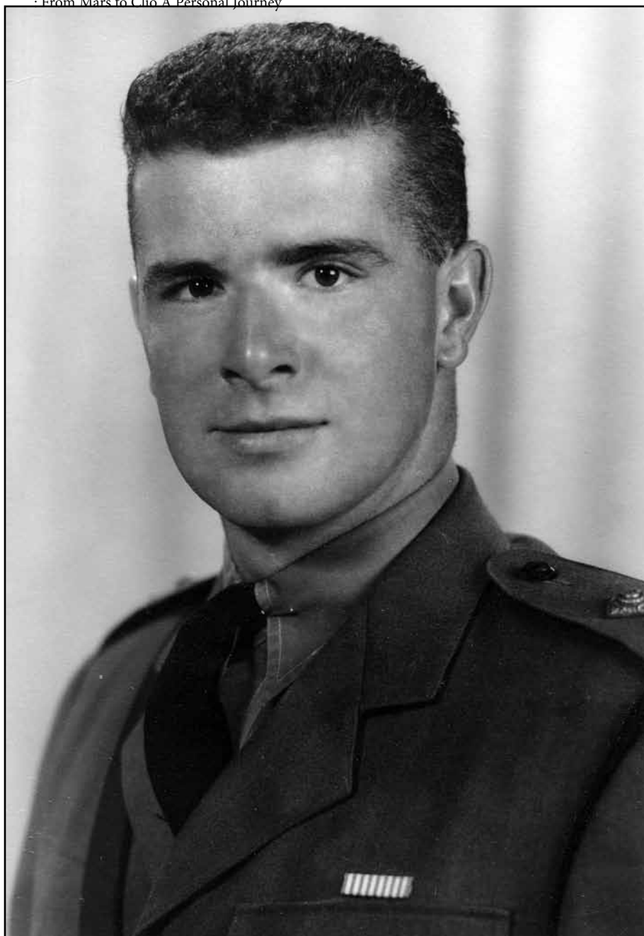
The author in 1956.