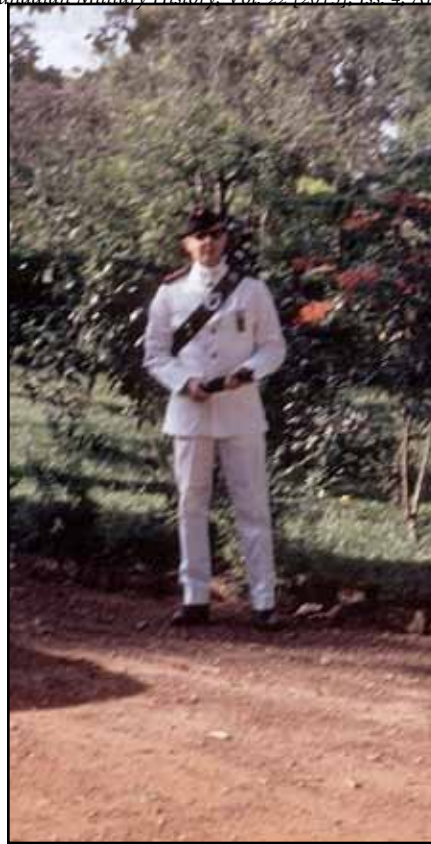
The author in Ghana.