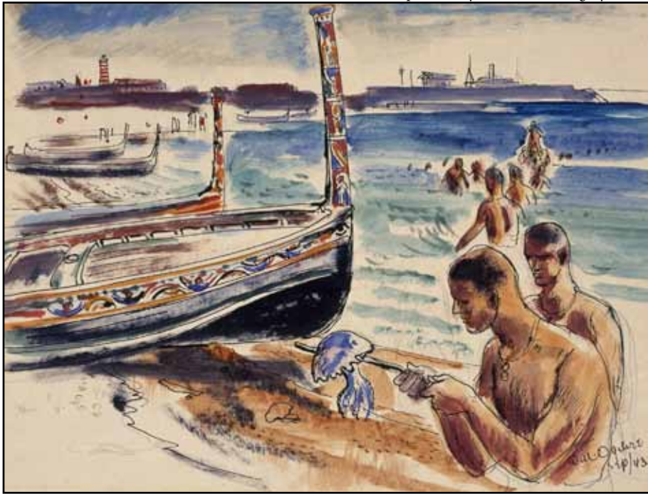
Beach Scene, Catania, Sicily.

contact with those at every level of the military hierarchy. While there can be little debate that artists and historical officers benefitted from the practicality of their own transportation after the campaign in Sicily, perhaps there was something lost in the added convenience.