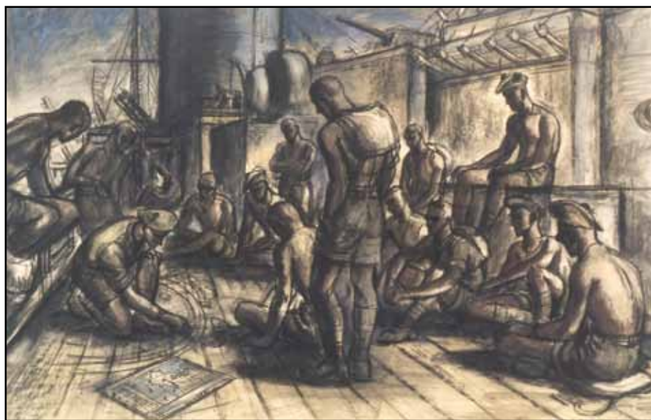
Above: His Majesty's Transport Circassia - 1st Canadian Division.