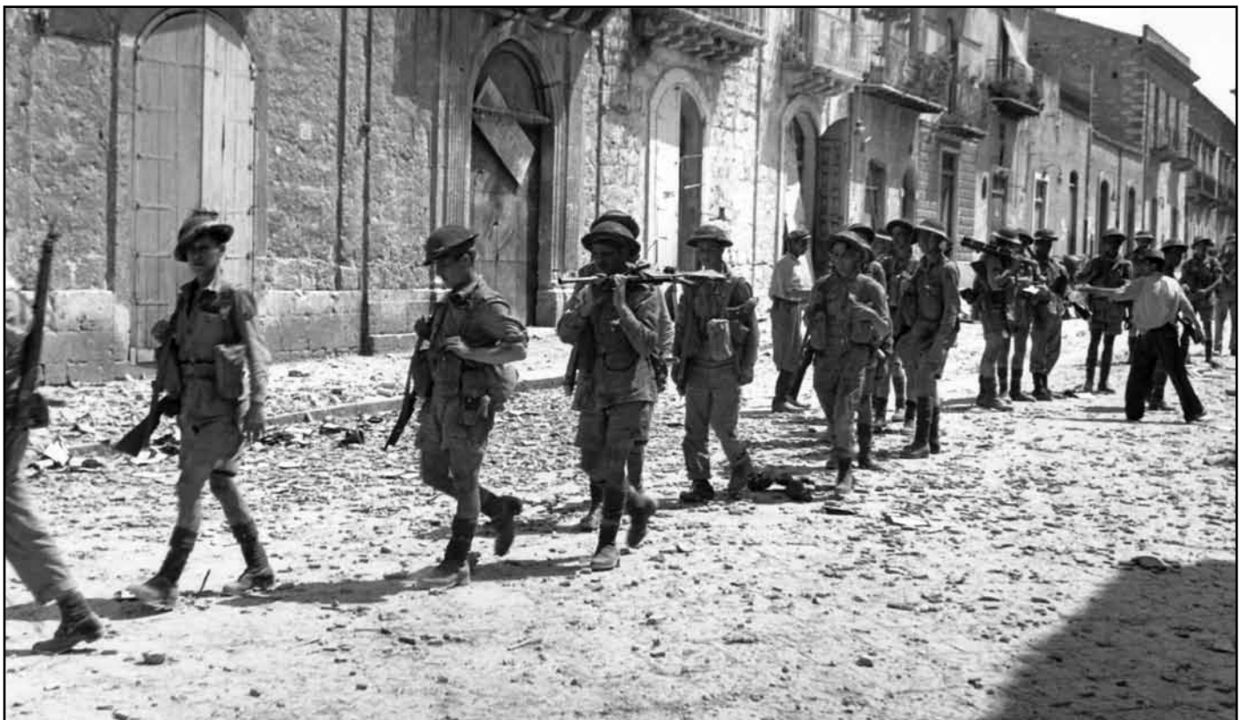
Library and Archives Canada PA 163671