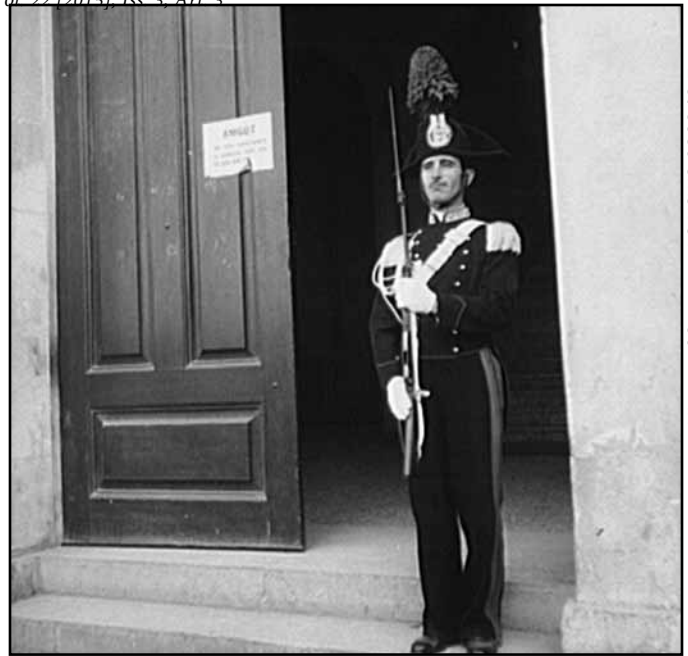
Left: Upon entering a town, the civil affairs officer in charge posted a series of proclamations in Italian and English outlining the terms of military government. Right: Carabinieri on duty in Sicily.