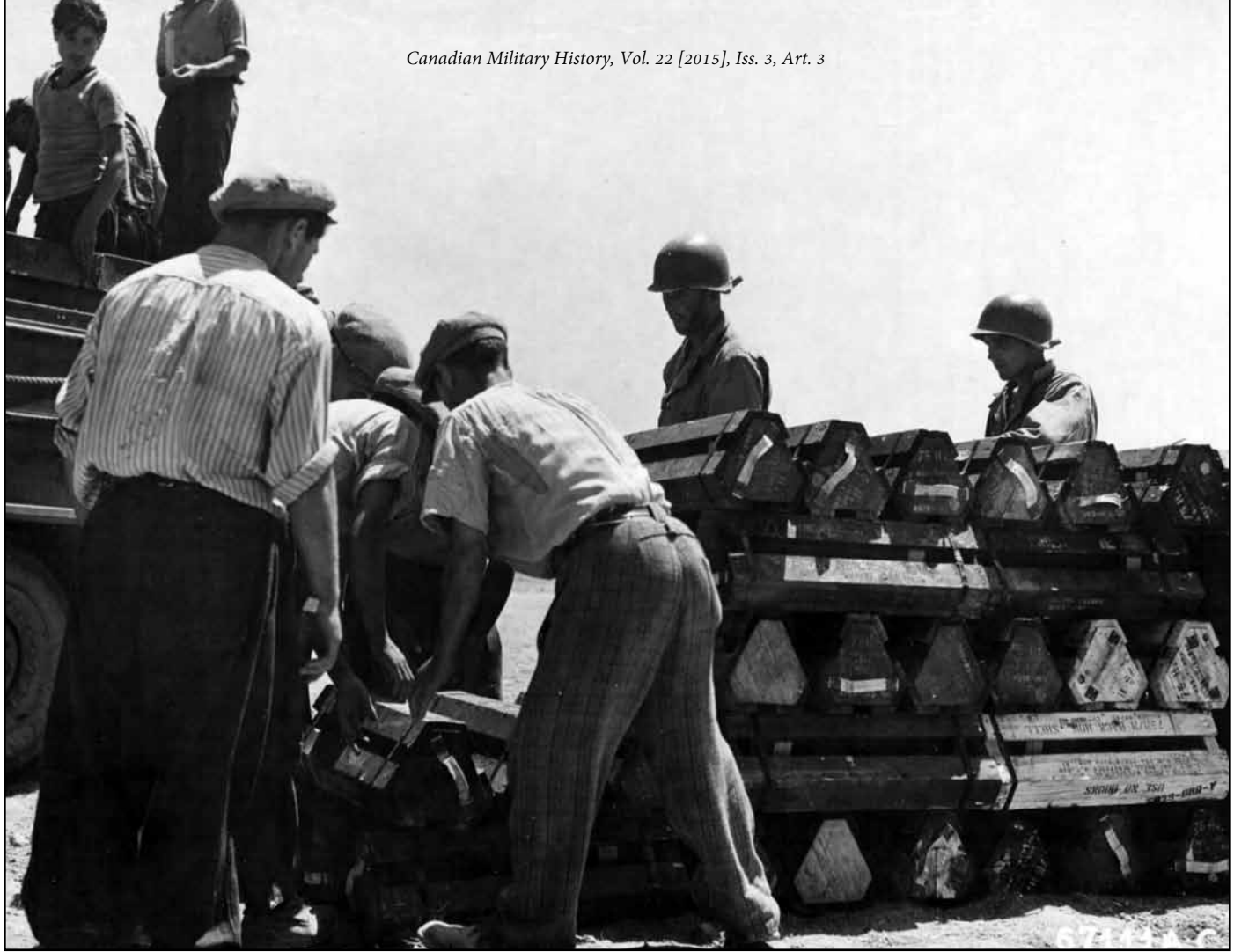
US Air Force Photo 67111 AC