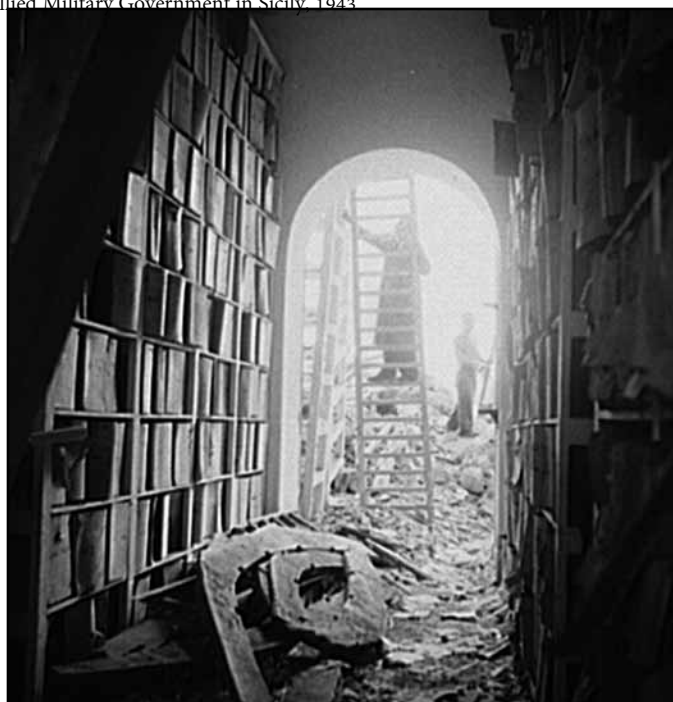
Left: Italian and British soldiers work together restore electricity to the towns. Right: The cities suffered extensive damage from Allied bombings and German destruction.

had fled at the first sign of invasion and abandoned the town. 42 With the help of a priest and the postmaster, the Seaforths located the granary, broke into it and distributed its contents to the people to alleviate the situation. 43 Such a feat in the middle of an advance took time and effort to organize by the Seaforths, whose time would be better spent in continuing the fight or resting and recovering for the next phase. In spite of this, their actions received the approval of the corps commander, Lieutenant-General Sir Oliver Leese. 44