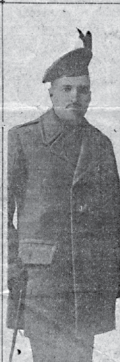
COL. J. L. RALSTON.

Sir Arthur Currie was petitioned by representatives of the soldiers to appoint to the Canadian body in attendance at the peace gathering some person specially concerned with their interests and, in reply, the promise was given that an appointment satisfactory them would be made. The choice of Sir Arthur Currie