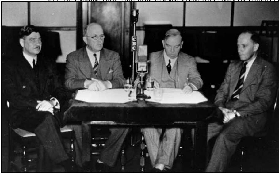
Top left: Mackenzie King and members of the Cabinet broadcasting messages to the Canadian people following the special emergency Cabinet meeting following Great Britain's declaration of war, 3 September 1939. From left to right, C.G. Power, Ernest Lapointe, Mackenzie King, and Norman Rogers.