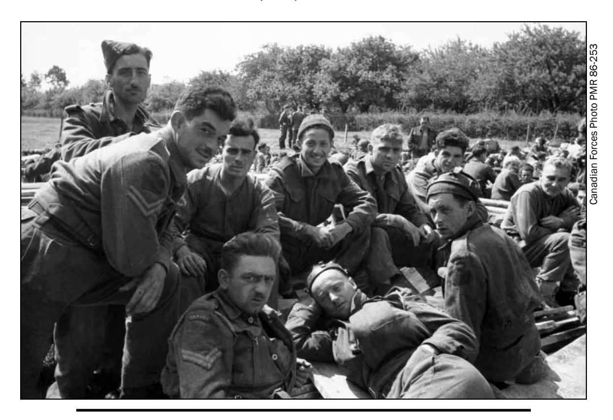
A German photograph of a group of Canadian soliders captured at Dieppe. It is believed that these men are from the Fusiliers Mont-Royal based on their shoulder patches.

two regiments lost in fifteen days [at Hong Kong] or the thousands of men sent to their death in five hours [at Dieppe].<sup>65</sup>