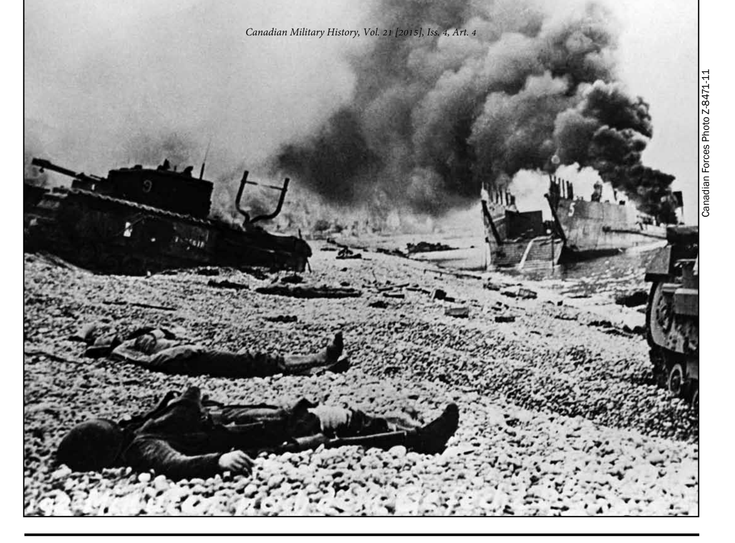
This iconic photo of Dieppe, taken by the Germans soon after the end of the fighting, captures the death and destruction suffered by Canadians on the beach.

the Dieppe raid. The first press releases confirmed the involvement of Canadians. On the home front, the war finally became a tangible reality, involving soldiers with which the population could identify. The public relations service of Combined Operations Headquarters attempted to transform a military fiasco into a victory with releases insisting that several objectives had been achieved. For over two months, it would present the Canadian military debut as a turning point in the war, a necessary sacrifice that would pave the way to the great invasion of Europe. From these military releases the press constructed a narrative that various newspapers adapted according to their particular perspectives.