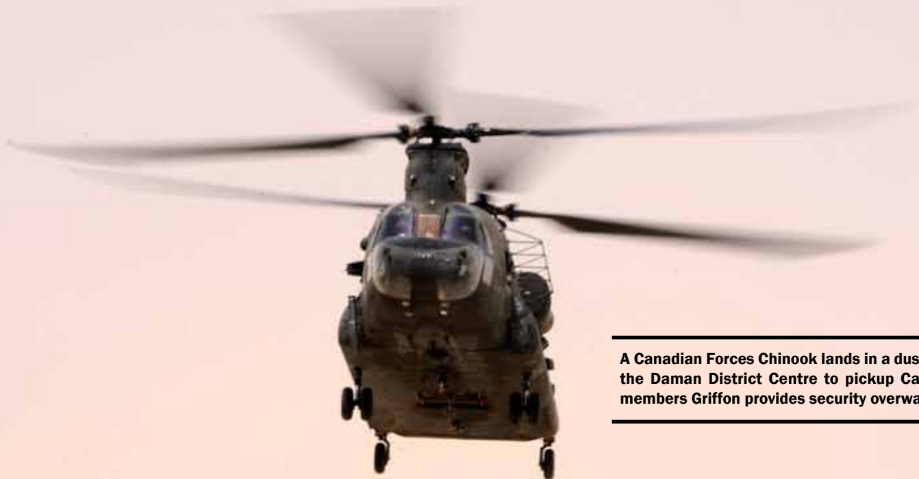
A Canadian Forces Chinook lands in a dusty field outside the Daman District Centre to pickup Canadian Forces members Griffon provides security overwatch.

The dragon symbol was probably inspired by the Taliban's reported description of the intense firepower brought down by the miniguns as the "Dragon's Breath of Alla."