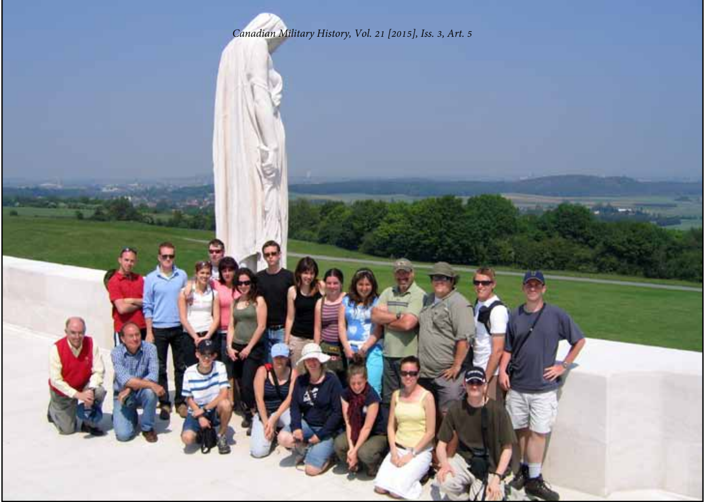
A battlefield study tour group stops at Vimy.

fields of war. A vast monument grew from fiery speeches and shrill commitments against forgetting, its ramparts and soaring figures facing down now-invisible foes, towering above the ghosts of those in whose name it so elegantly stood. Life and commerce and farming soon resumed, but only around Vimy's demarcated margins, the stone evidence of war and remembrance striking upwards like an iceberg's tip amidst the fields, its base grounded far below, in the sullied dirt of violent times.