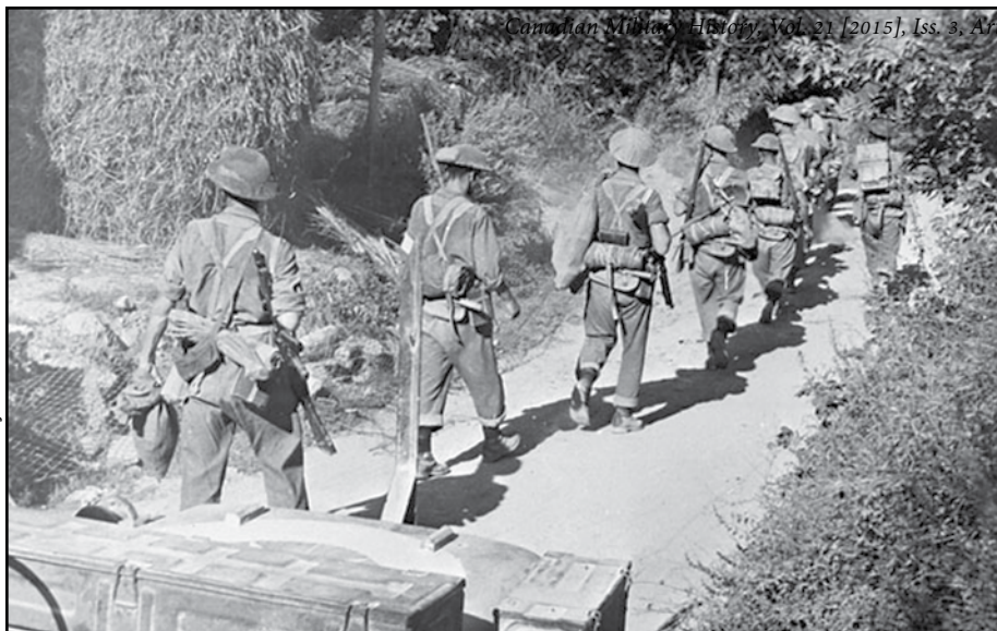
Infantrymen of the 48th Highlanders of Canada advancing on Point 146 during the advance on the Gothic Line near the Foglia River, Italy, 28-29 August 1944.

NCOs to 1 CBRD to assist in the training of personnel remustered to infantry. 50 Other operational units almost certainly did likewise.