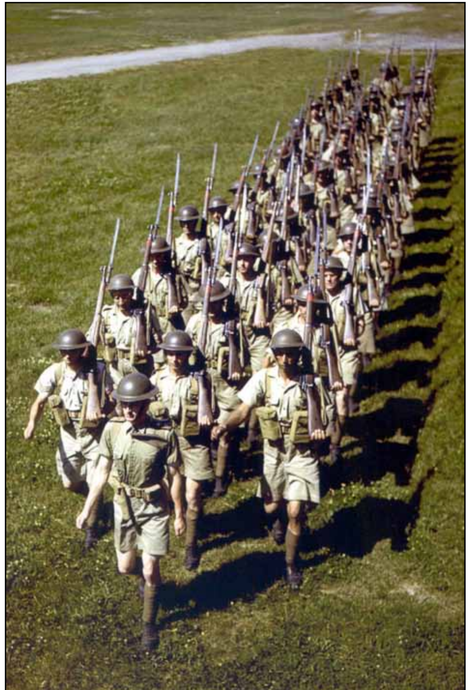
Canadian Forces Joint Imagery Centre ZK 246

"basic refresher courses" of two, four and six weeks duration, and one "advanced training" course. 16 In March 1944, all CIRUs implemented a mandatory two-week refresher course for all new arrivals. All soldiers who completed the course then had to pass weapons handling tests, known as Tests of Elementary Training (TOETs). Soldiers who failed the tests received further basic training, while the rest continued to receive advanced refresher training while awaiting call-up for service in