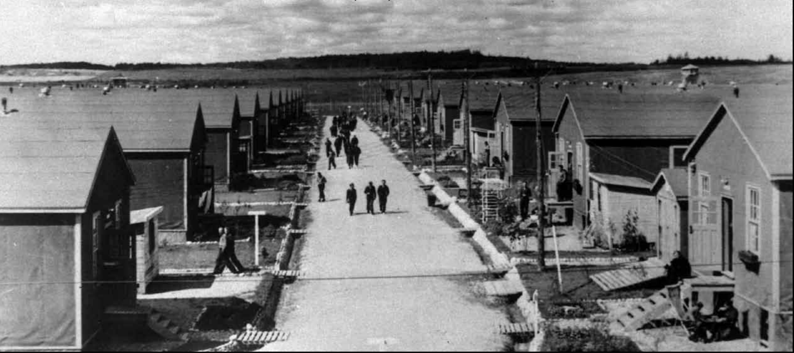
A view of Camp No.23 at Monteith, Ontario.

safely transporting POWs during the Second World War.