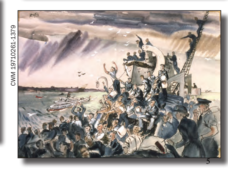
Publis Pred by Scholars Commons @ Laurier, 2010