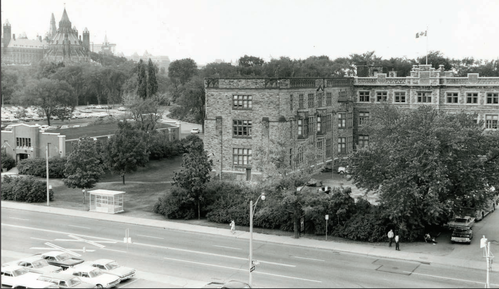
The original Canadian War Museum on Sussex Drive (here photographed in 1967) enjoyed a prominent location in Ottawa (note the Parliament Buildings in the background) but the building itself was unsuitable for a national museum.

The 1991 report of a Task Force on Military History Museum Collections in Canada damned the museum as an “embarrassment” and a “national disgrace.” 12 The report concluded that contemporary museum design and technology had far outpaced the Canadian War Museum’s practices, while the research function, on which an historical museum depended, was completely inadequate. Well covered in the media, the report demanded better resources for the museum and suggested that it would be better off as an independent agency, separate from its parent institution, the Canadian Museum of Civilization Corporation (CMCC). The CMCC responded to the criticisms with $1.7 million for the war museum’s exhibits. A contract was then awarded to the Toronto architect A. J. Diamond