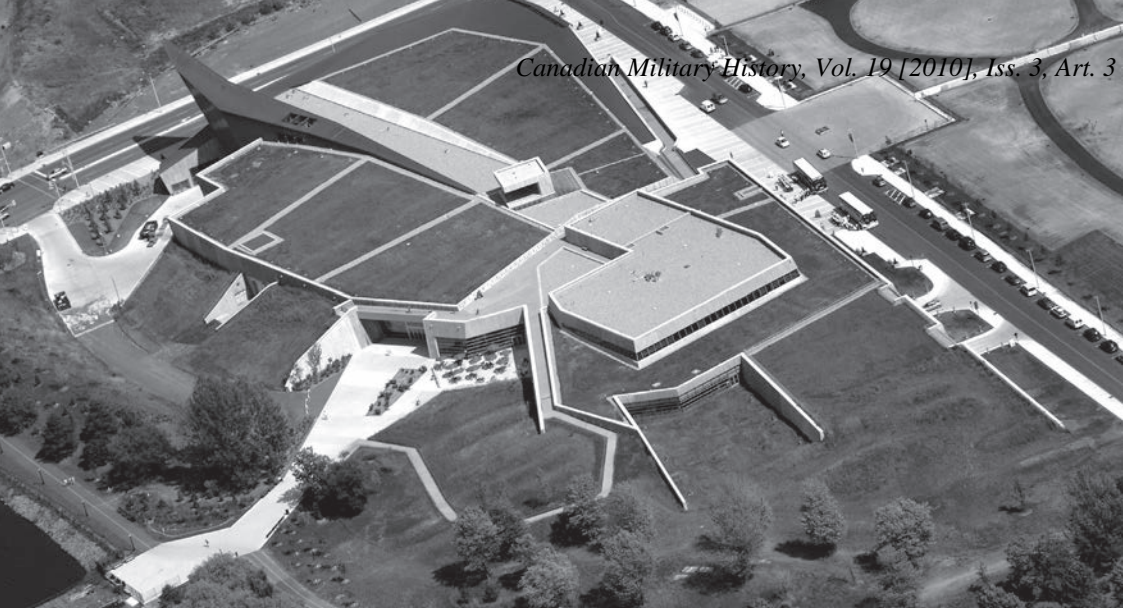
Left & right: The new Canadian War Museum located on the LeBreton Flats opened in May 2005.