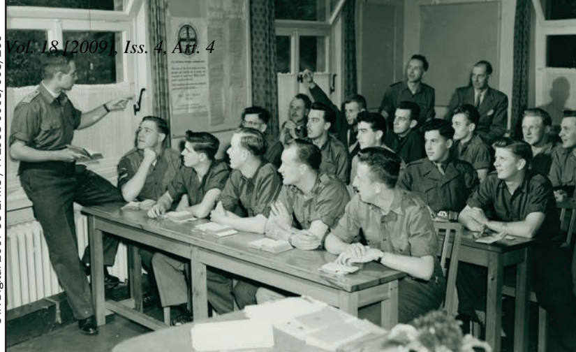
UTA Digital 2007-53-14MS / A 1968-0003/003/282