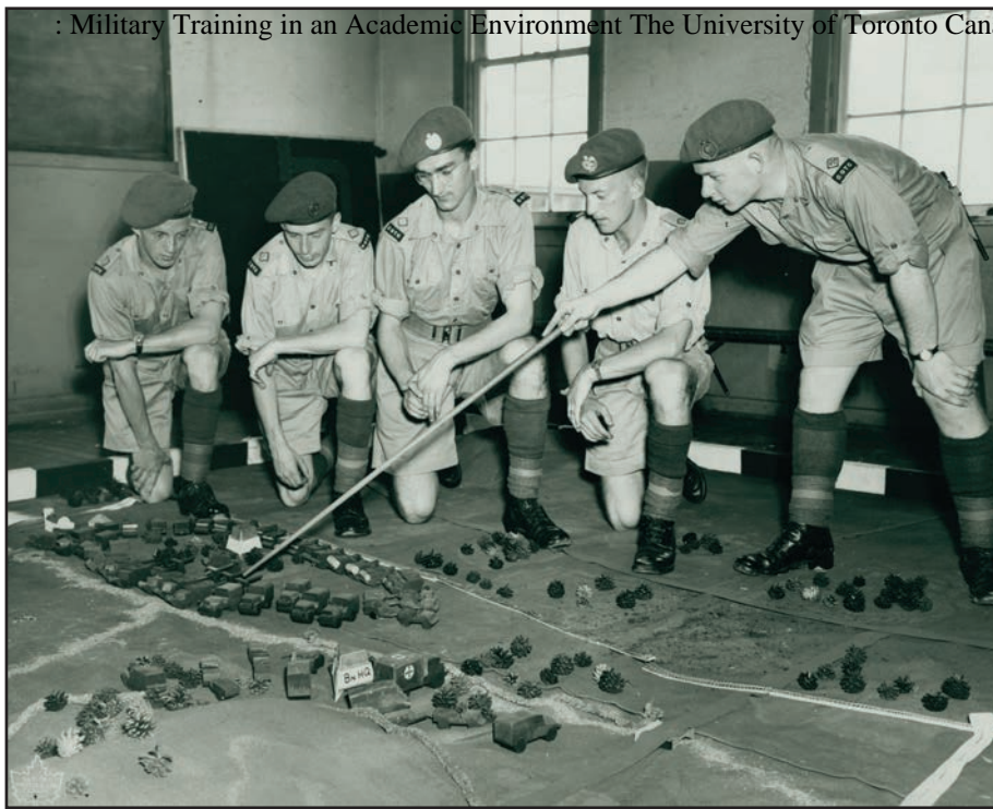
UTA Digital 2007-53-22MS / A 1968-0003/003/281