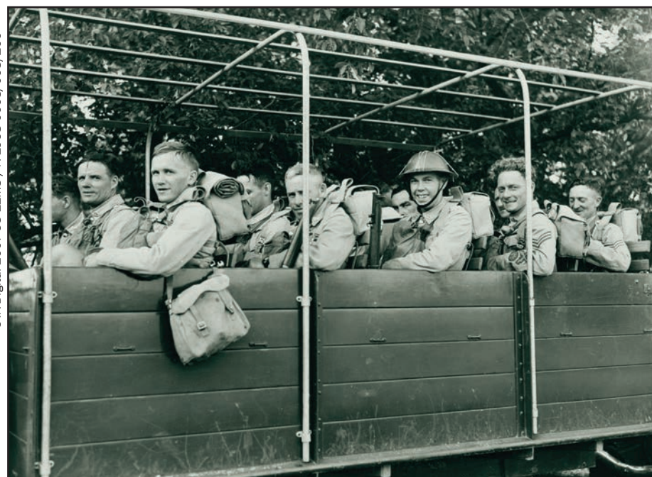
UTA Digital 2007-53-11MS / A 1968-0003/003/200