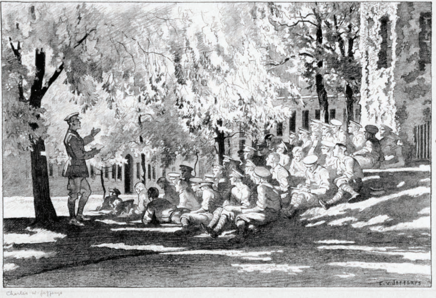
Charles William Jefferys "Outdoor Lecture To Canadian Officers, Victoria College, Toronto"