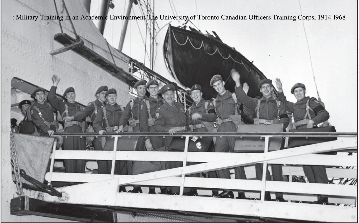
COTC officers from Ontario disembark from the Empress of Canada in Liverpool, England on 17 May 1952. They are bound for Hanover, Germany where they will spend three months serving with the 27th Canadian Infantry Brigade.

units, based on the curriculum of the Service Colleges. 54 But the fate of the COTC was being decided elsewhere.