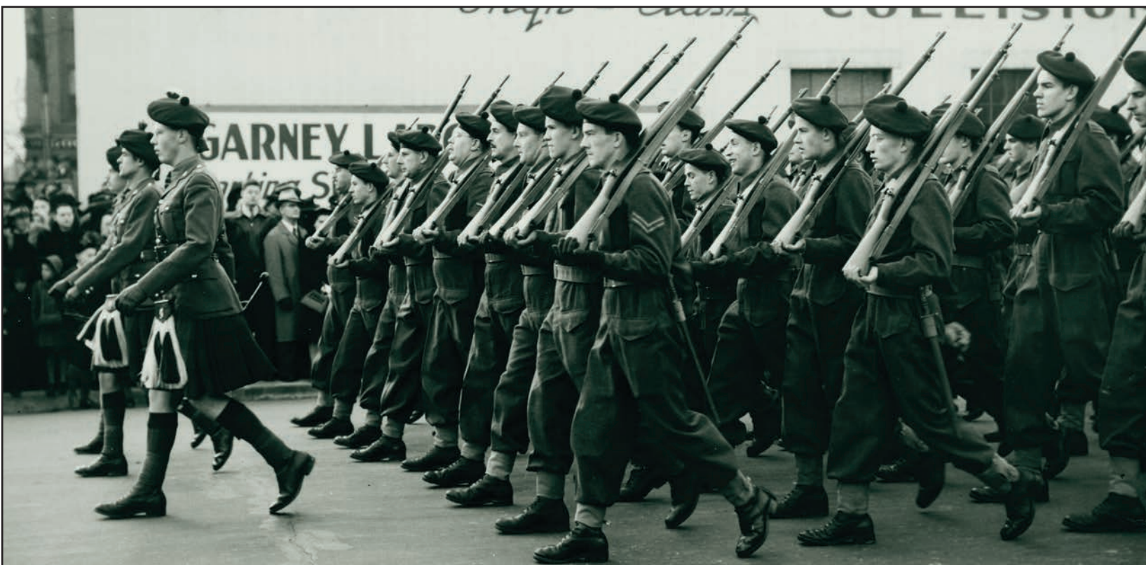
The University of Toronto COTC contingent marching through the streets of Toronto during the Second World War.