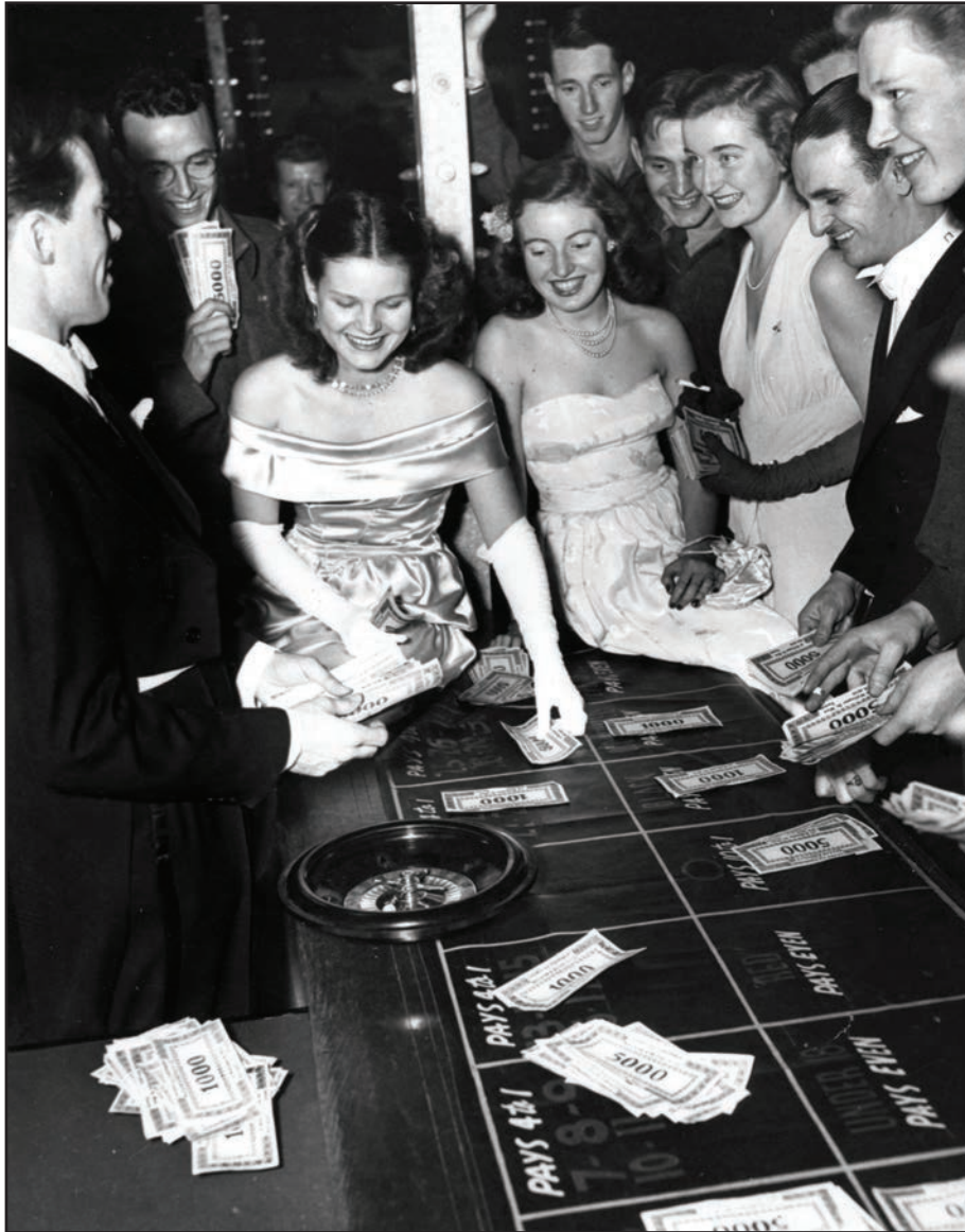
UTA Digital 2008-15-3/M5 / A 1968-0003/009/18