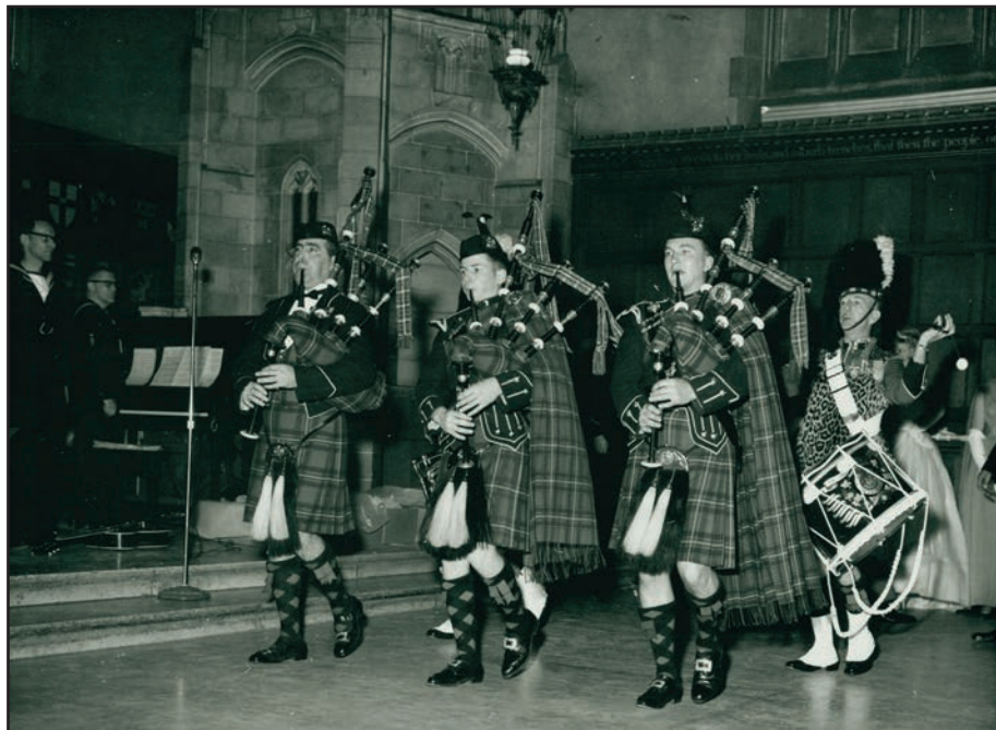
Pipers lead the way into the Annual Tri-Service Ball, 25 January 1963.

UTA Digital 2007-53-3MS / A 1968-0003/002/104