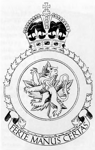
Badge of 427 (Lion) Squadron RCAF

affiliations that they were employed extensively in the first popularized RCAF History which appeared in the war's immediate aftermath. 35 They were disdained by the more orthodox official history which appeared in the 1990s, however. 36 That was unfortunate. Nevertheless, the squadrons of the current Air Command which carry the wartime numbers continue to observe much of this proud heritage passed from their predecessors.