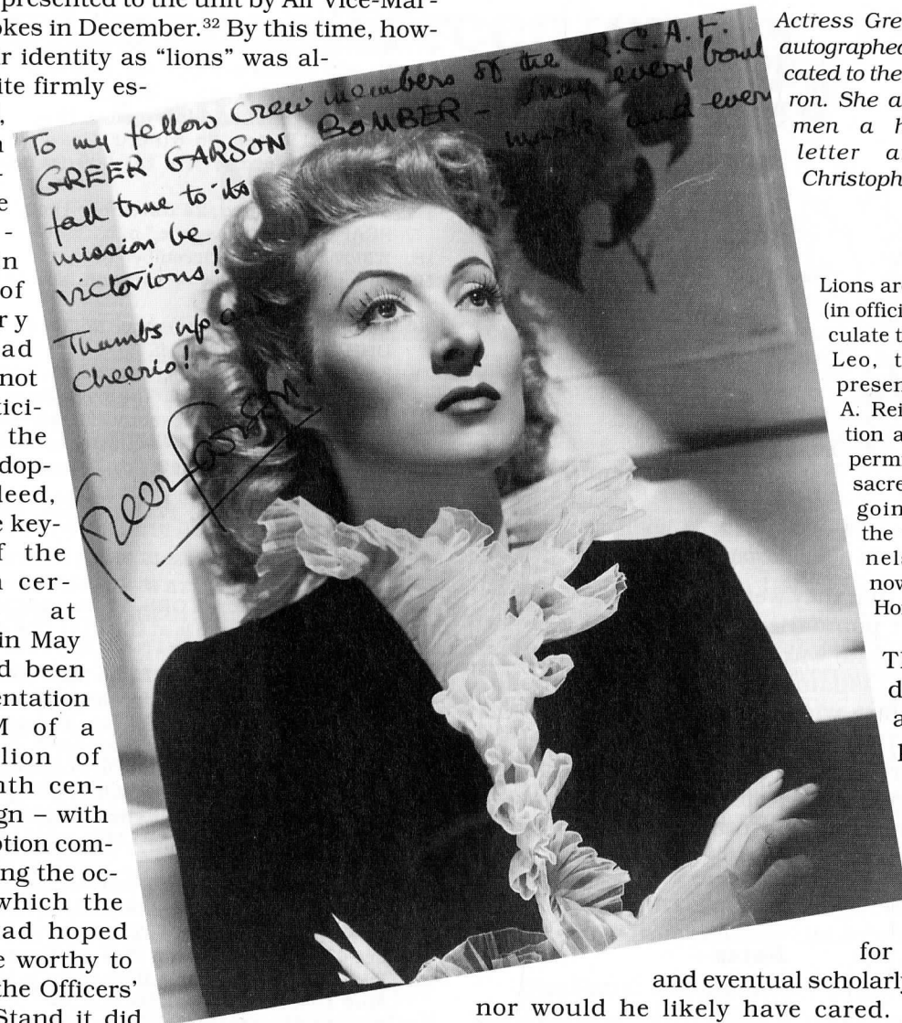
Actress Greer Garson's autographed photo dedicated to the Lion Squadron. She also sent the men a handwritten letter and a St. Christopher medal.