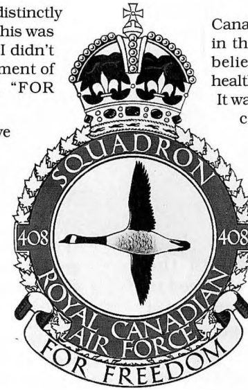
Badge of No.408 (Goose) Squadron.

The badge can now be seen near the altar of St. Clement Danes Church in London, carved in slate and set in the floor, a very fitting tribute to a great squadron and many brave men. 11