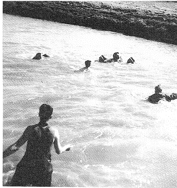
Soldiers from Viking Force engaged in training on the Isle of Mull, April 1942

Sussex coast red every night if they wanted to – just as long as they could complete a fifteen-mile route march or spend eight hours a day in cliff-climbing if that was what their instructors laid on as the day's entertainment. At Seaford, they practiced with the usual personal weapons – .303 Lee-Enfield, .38 Webley, .45 Thompson sub-machine gun, as well as Brens, mortars, and the Boys anti-tank rifle. In addition, they learned to kill swiftly with Fairbairn knives and strangling wires – which served double-duty as rabbit snares to supplement the always-inadequate British rations. To test their susceptibility to sea-sickness, the Vikings were sent out in little fishing boats into the unpredictable waters of the English Channel, to face the Commandos' refinement of the medieval Ordeal by Water: being thrown overboard with full packs to test their ability to survive in the worst conditions.