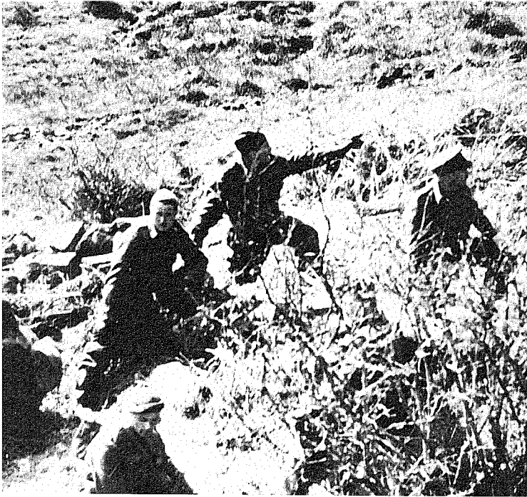
Above: Colonel McCool (pointing) training in the field with Viking Force, April 1942.