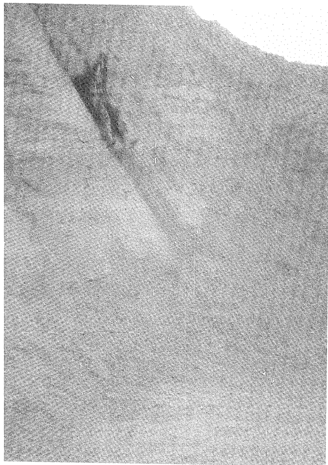
Left & below: Soldiers from Viking Force engaged in training on the Isle of Mull, April 1942